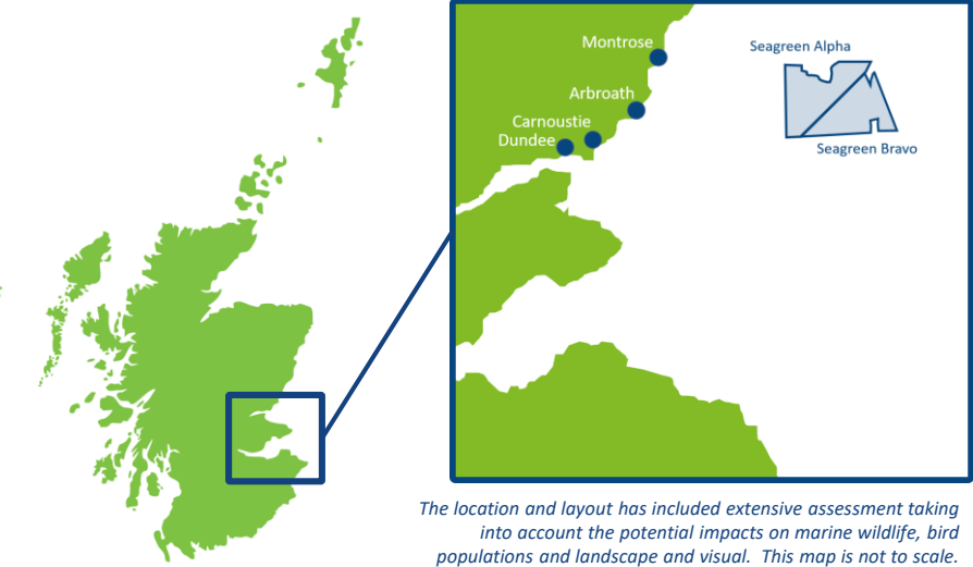
The location and layout has included extensive assessment taking into account the potential impacts on marine wildlife, bird populations and landscape and visual. This map is not to scale.

Seagreen Phase One within the Zone includes the development of two windfarms, 'Seagreen Alpha' and 'Seagreen Bravo', located over 27km from the Angus coastline with a potential combined capacity of up to 1.5GW.