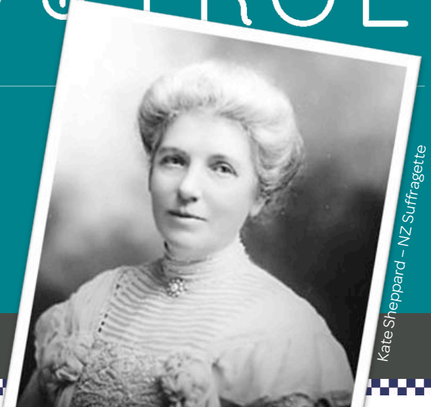
Kate Sheppard – NZ Suffragette