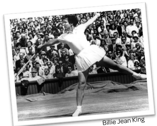
Billie Jean King