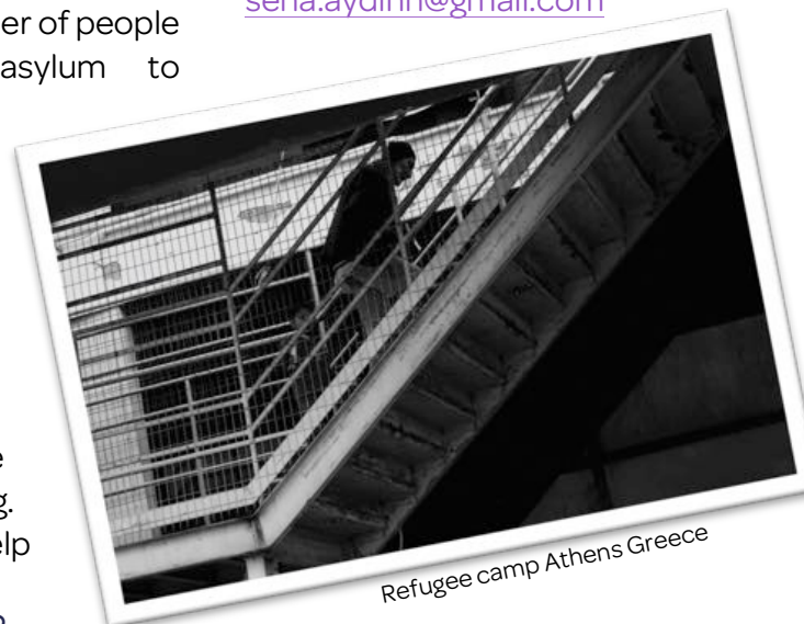
Refugee camp Athens Greece

especially after the eruption in the number of people seeking political asylum to different countries, having to leave everything behind in order to be able to build a new life. There was no way for me to see those people suffer like that and do nothing. Now I try to help