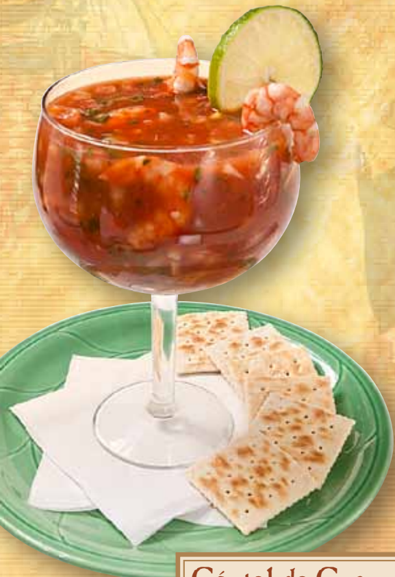
Cóctel de Camarón

Enchiladas Cancún Two shrimp enchiladas topped with cheese dip, served with Spanish rice, lettuce, tomatoes and guacamole – 10.99