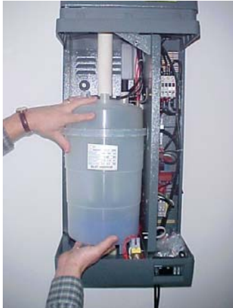
Easily Replaced Cylinder

Don't let a little bit of humidity COST you a lot of money $$$$ !! Call us today for room mounted or CTP Integrated humidity systems.