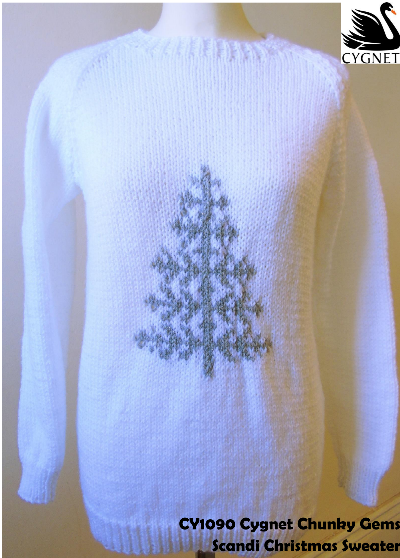
CY1090 Cygnet Chunky Gems Scandi Christmas Sweater