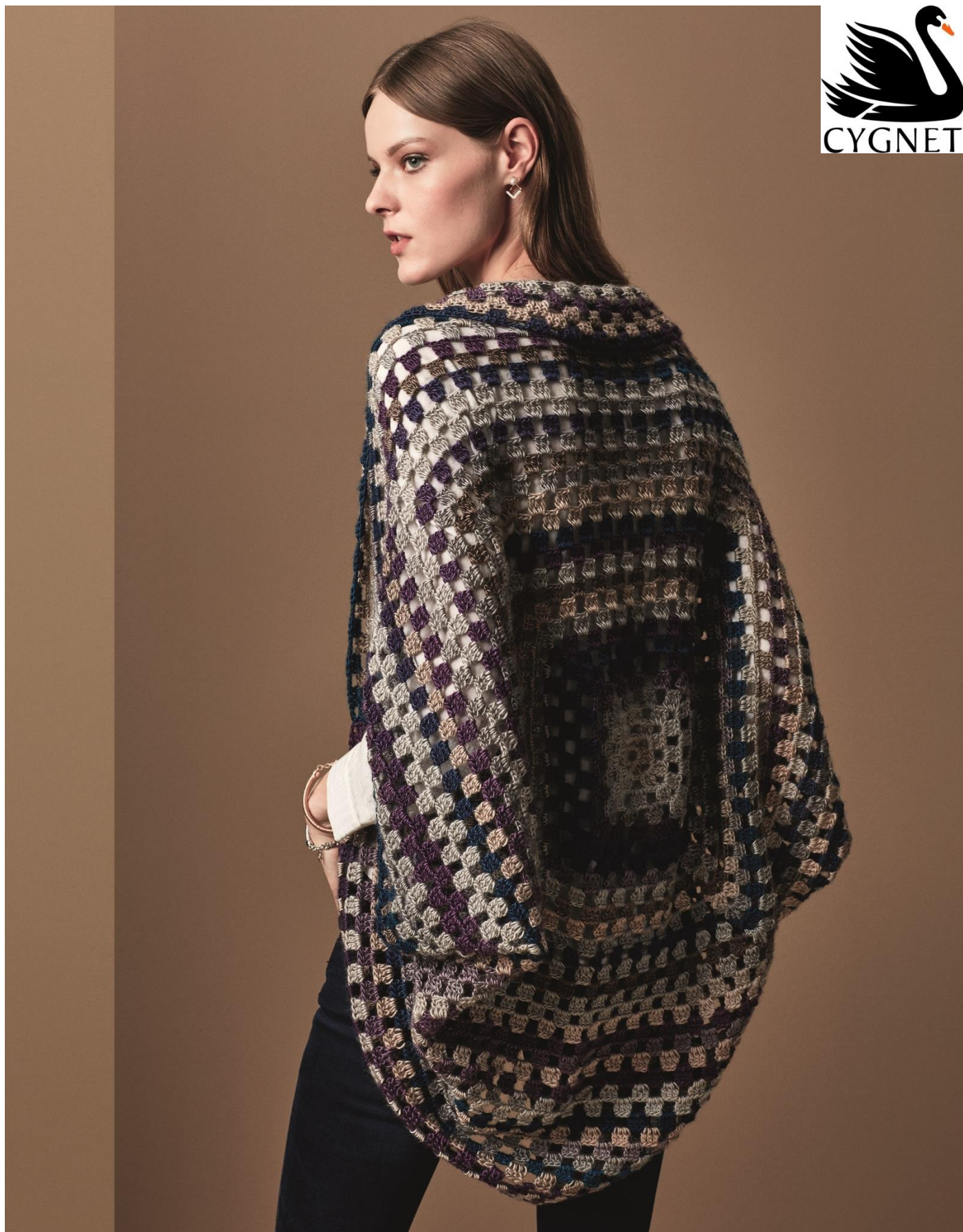
CY1061 Cygnet Boho Spirit Chic Cardigan