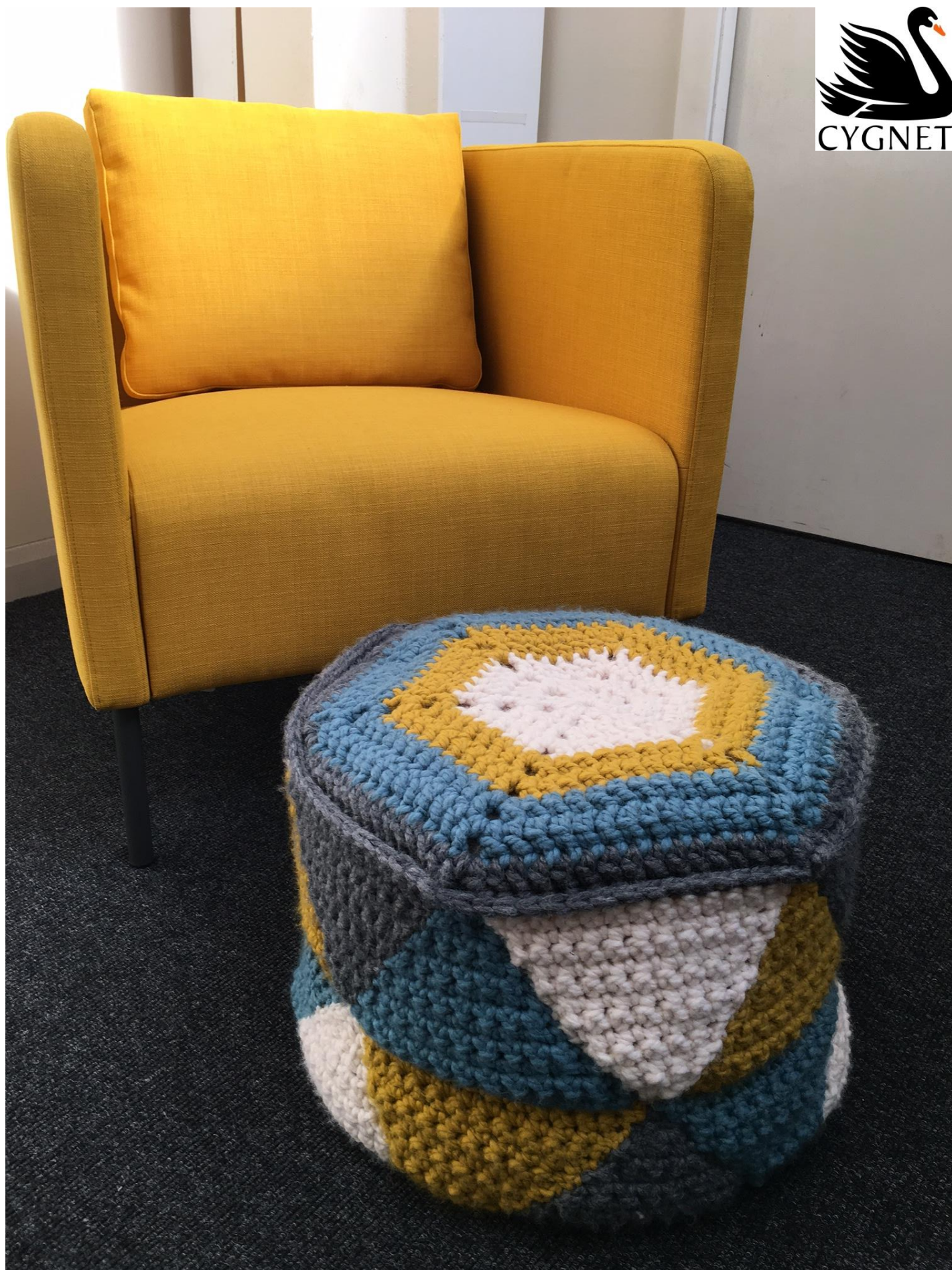
EY1037 Cygnet Seriously Chunky Geometric Pouffe