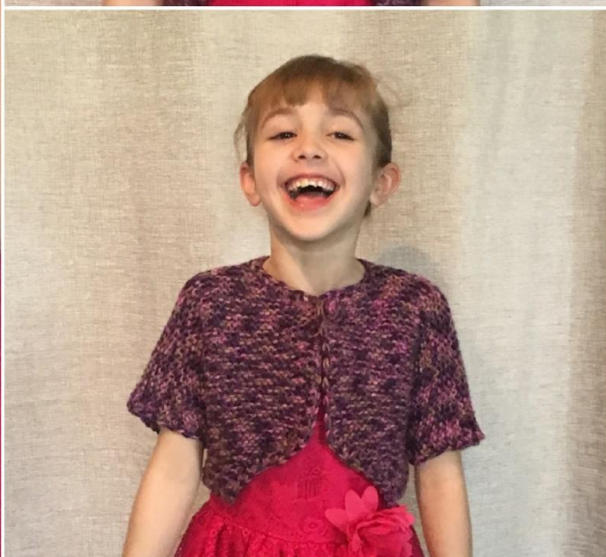
CY1070 Utopia Chunky KIDS BOLERO