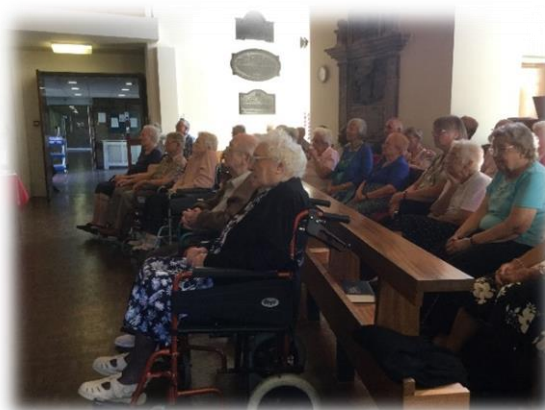
Residents, Friends & Guests enjoying the Sunday Afternoon Concert