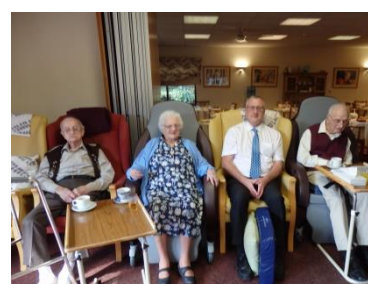
and Agnes house residents