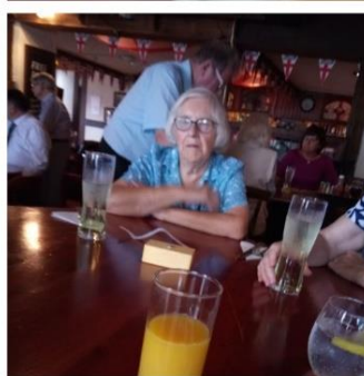
Residents Pub Lunch Wednesday 18 th July 2018