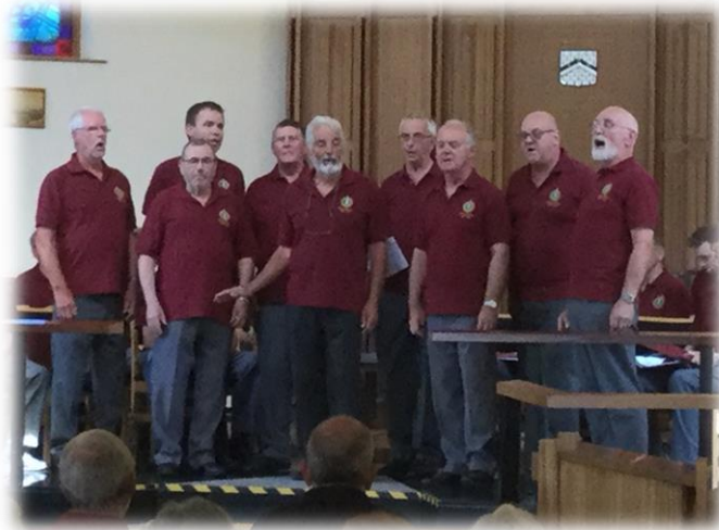
The Shanty Boys

The Loughborough Male Voice Choir entertained us with a selection of songs from shows, musicals, spirituals and sea shanty's. Loughborough Male Voice Choir has over 50 mostly active members and over half of them (about 30) came to share their skills with us at their concert.