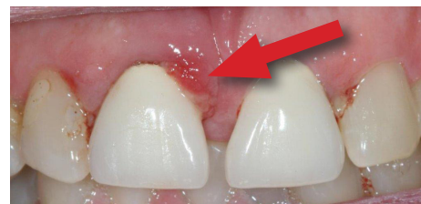
Before Surgical Periodontal Therapy

After periodontal surgery you should not use hard toothbrushes or other dental hygiene aids that may irritate the surgical site. Post-treatment limitations during healing include doing your best not to chew or put forces on the surgical site. As with any wound healing, a faster result with fewer complications will occur if the surgery site is left unharmed.