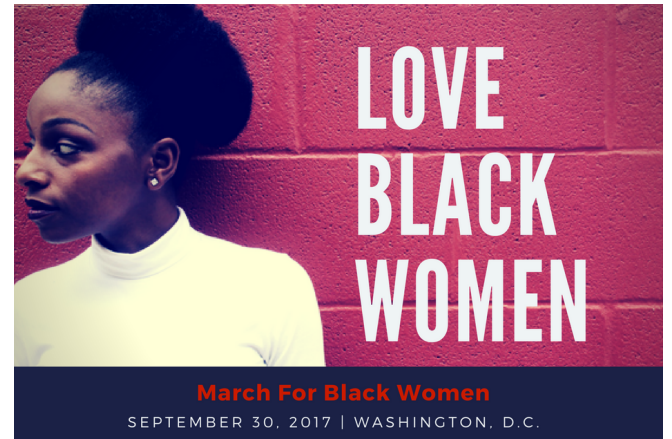
March For Black Women