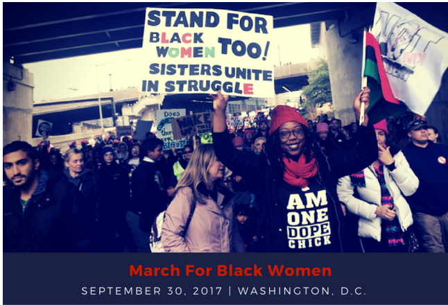
March For Black Women

Primary Hashtags: #EveryBlackWoman, #M4BW, #MarchforBlackWomen