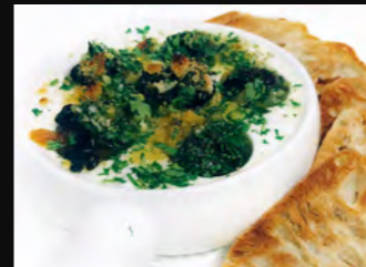
Escargots (6pcs) / 10.9 Herb Garlic Butter and Tomato, served with Rustic French Baguette.