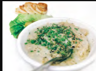
Homemade Duck Rillettes / 6.9 Served with Double Mustard, Gherkins, Onion and Rustic French Baguette.