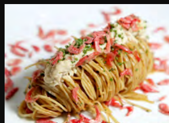
Original Saveur Pasta / 5.9 / 10.9 Chilli Oil, Chopped Kombu, Pork Sauce, Sakura Ebi. (Starter size / Main size)