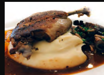
Signature Duck Confit / 18.9 Mashed Potato, Sautéed Mushrooms, Orange Segment, Natural Jus.