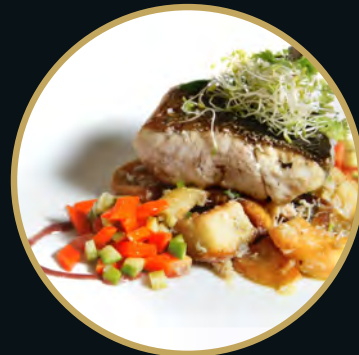
Sea Bass add $3++