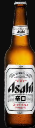
Asahi Original, 33CL / 10