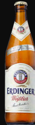
Erdinger Weissbräu, 50CL / 14