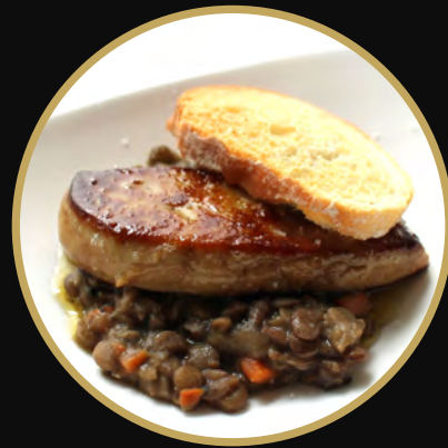
Truffle Foie Gras