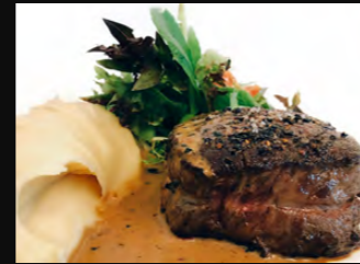
Steak Au Poivre / 26.9 Tenderloin Cut, Mashed Potato, Peppercorn Sauce, Mesclun Salad.