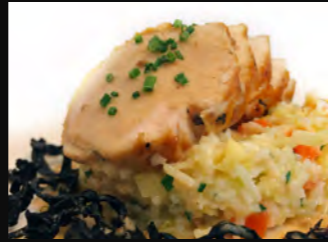
Herb-Roasted Chicken Breast / 16.9 Creamy Basmati Rice, Black Trumpet Mushroom, Truffle Parmesan Sauce.