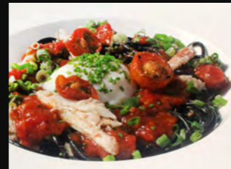
Chilli Crab Squid Ink Pasta / 18.9 Buttered Crab Meat, Squid Ink Pasta, Spicy Chilli Crab Sauce, Poached Egg.