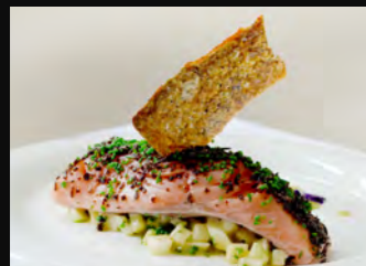
Salmon Confit / 11.9 Chives, Kombu, Apple, Fennel, Capers Vinaigrette.