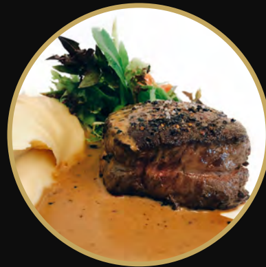
Steak Au Poivre