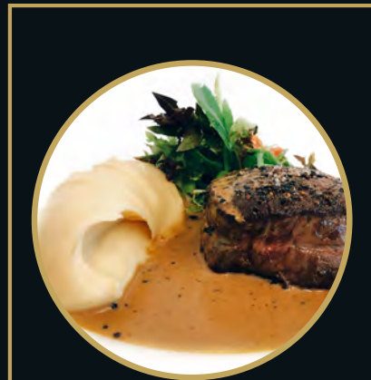
Steak Au Poivre add $10++