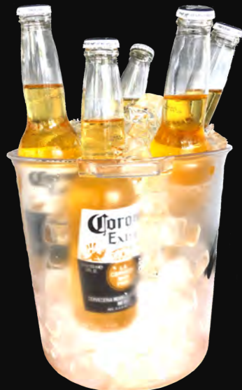
Bucket of 5 (Any mix of 33CL) / 42