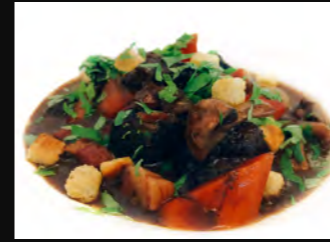
Beef Bourguignon / 20.9 Beef braised in Red Wine, flavoured with Carrot, Pearl Onion, Smoked Bacon, Mushroom, and Mashed Potato.