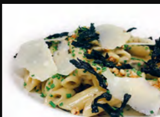
Wild Mushroom Penne / 16.9 Penne Pasta, Crispy Trumpet Mushroom, Wild Mushroom, Parmesan Cheese. (Suitable for Lacto-Ovo Vegetarians)