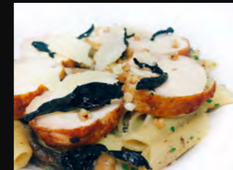
Chicken Mushroom Penne / 16.9 Chicken Breast, Penne Pasta, Crispy Trumpet Mushroom, Wild Mushroom, Parmesan Cheese.