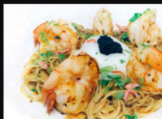
Tiger Prawn Aglio Olio / 18.9 Tiger Prawn, Chili, Garlic, Olive Oil, Sakura Ebi, Poached Egg.