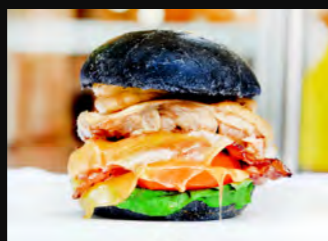
Saveur Duck Confit Burger / 18.9 Saveur's Signature Duck Confit, Natural Jus, Melted Cheddar, Fried Onions, Bacon, Charcoal Black Buns.