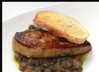
Truffle Foie Gras / 13.9 Truffle Oil, Creamy Lentil