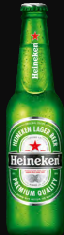
Heineken, 33CL / 10