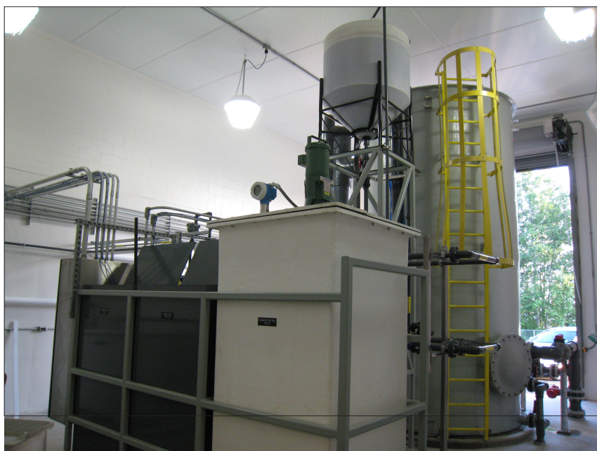
MIEX® MagnaPak® System at Newport WTP

Since the system utilizes a continuous ion exchange regeneration process, treated water quality is consistent. The system also produces very low waste volumes typically less than 0.05% of throughput.