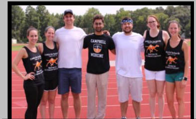
Camels on the Run 5k Leadership Team

Before the 5k race, the eighty race participants readied themselves at the starting line while the children waited on the sidelines to participate in their own race which followed the 5k.