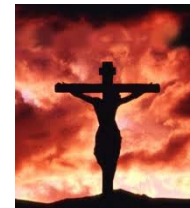
Sat 26 Mar