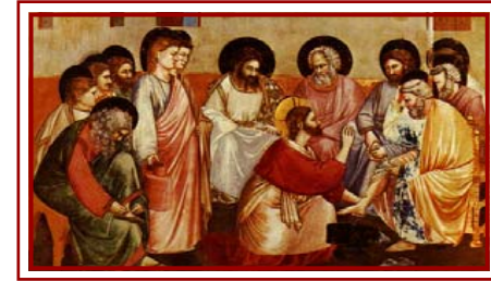
(Washing of the Feet)

The Clergy of the Parish wish you all the JOY and PEACE of the RISEN CHRIST