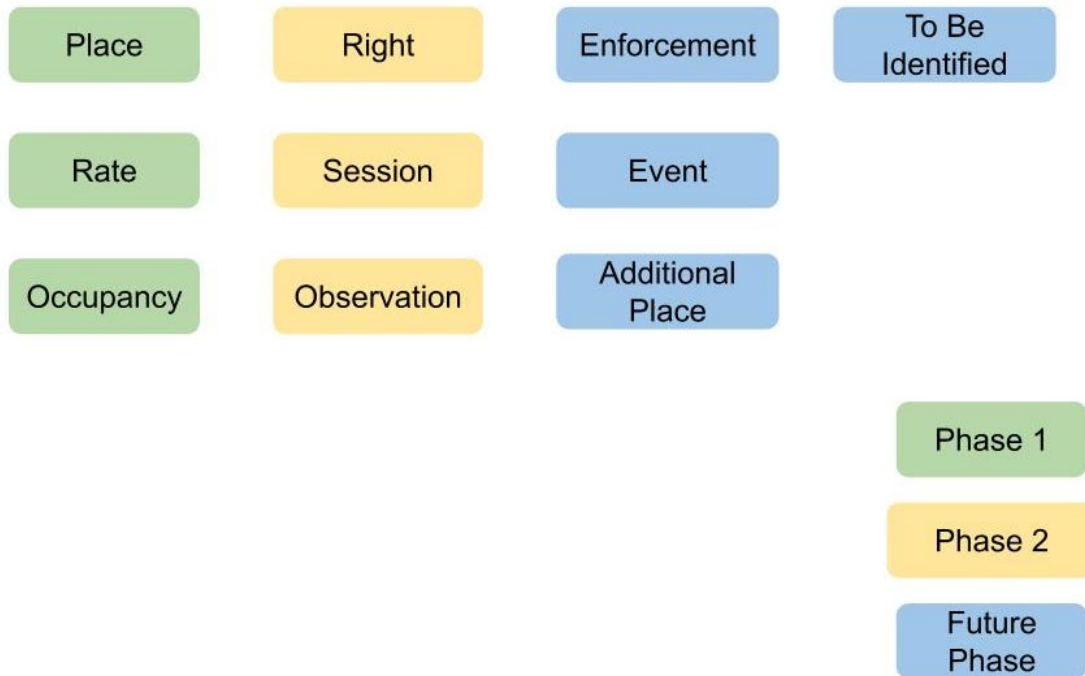
Figure 1: Parking Data Overview

Developing a complete set of specifications to cover every possible data element related to parking is a significant and time-consuming undertaking. APDS has established milestones and deliverables to break this initiative down into achievable and meaningful steps. By grouping data elements into specific data domains, we allow the community to work on specific data domains to create a specification. Figure 1: Parking Data Overview shows the phased delivery of data domains that comprise the APDS Specifications.