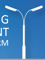
Screenshot 1 - inteliLIGHT® streetlight control software