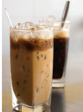
Vietnamese Espresso with Condensed Milk $4.75