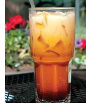
Thai Iced Tea $4.95