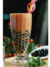
Black Milk Tea $4.95