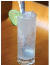
Fresh Limeade $3.50

Add Boba for an additional $.50 Add Fruit Jellies for an additional $.50