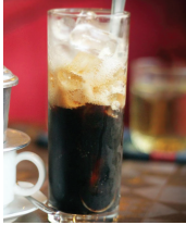
Vietnamese Black Iced Coffee $4.75