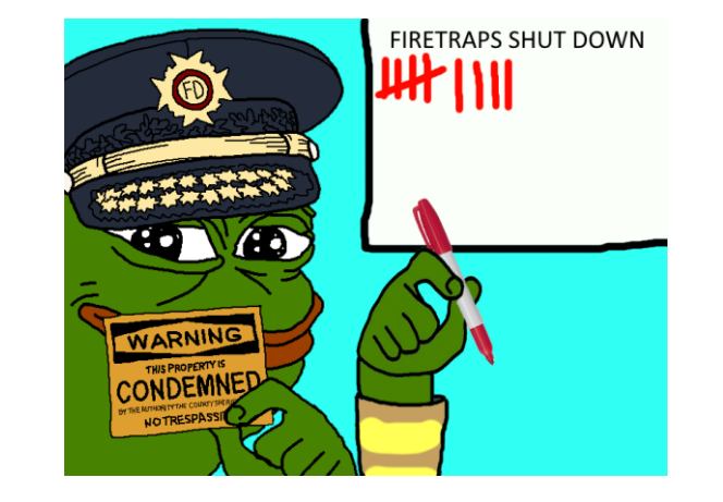
Figure 3. A meme posted on the same /pol/ thread tallying the number of DIY safe spaces for whose shutdown users claimed responsibility and/or took credit.