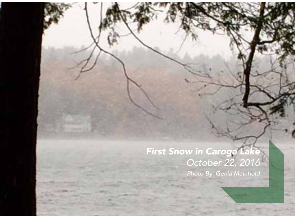
First Snow in Caroga Lake October 22, 2016