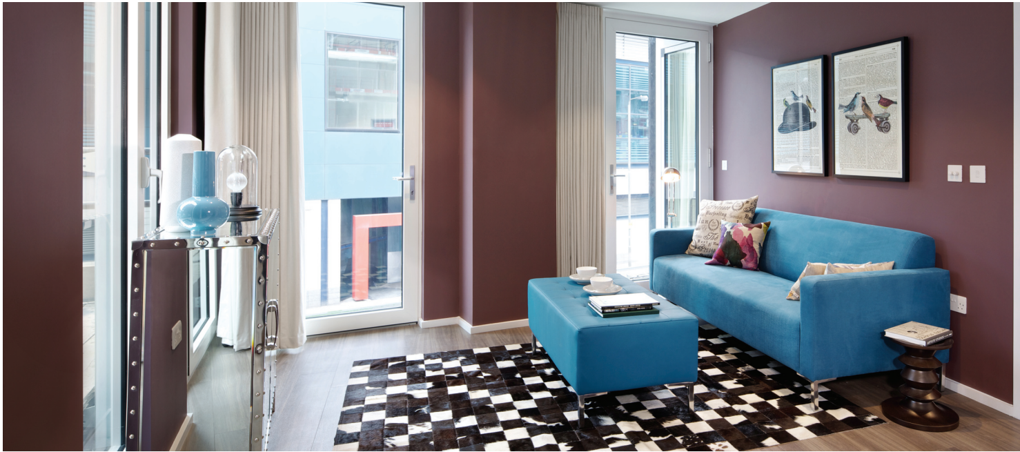
Suna Interior Design, The Filaments.

WHAT DO YOU THINK OF THE PLUMMY HUE OF MARSALA, THE PANTONE COLOUR OF THE YEAR AND WILL YOU BE USING THIS FULL-BODIED, 'NATURALLY ROBUST' SHADE IN YOUR SCHEMES IN 2015?