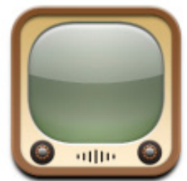
The YouTube App on your mobile device often activates when users visit your website from their mobile device and watch a YouTube embedded