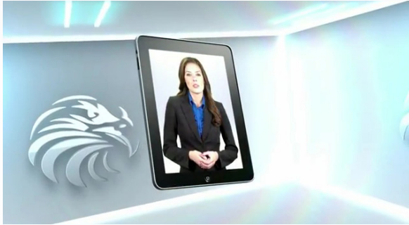
This is the actual thumbnail for one of our videos on YouTube (the thumbnail is generated by YouTube).

would you be more inclined to click and watch?