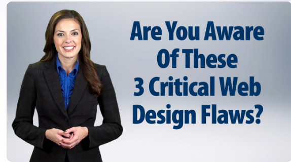
This is the EXACT SAME video hosted on our website with a customized thumbnail. (Yes, it has rounded corners on the video.)

At Fine Point Marketing, we host our client's videos for them and triple encode all of our videos for our clients so that they play back seamlessly in HD (high definition), SD (standard definition), and on mobile devices without forcing visitors to leave the page. And yes, they work perfectly on iPads and iPhones, everytime—even when streaming over cellular networks. Additionally, we always custom create a video thumbnail so that visitors to your website will want to push play and actually watch your video.