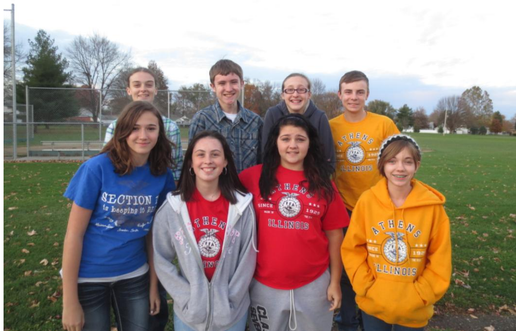
FOOD SCIENCE CDE 2014