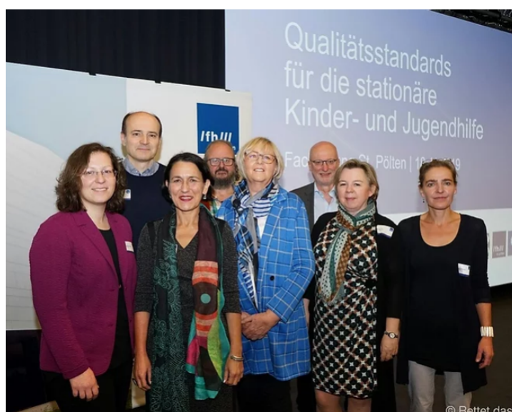
Regional round tables/events: Quality Standards for professional Out-of Home Care of Children and Youth