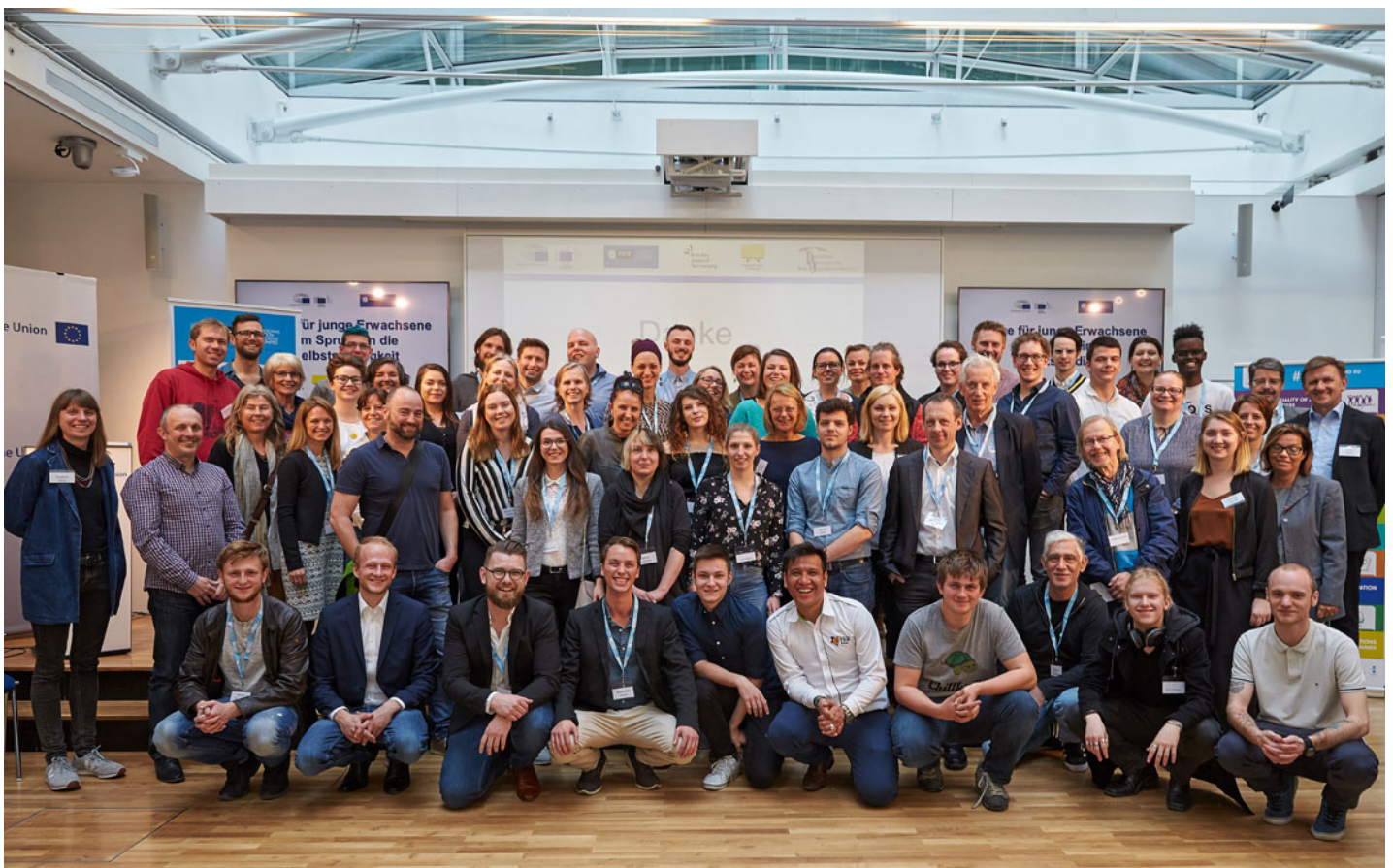
Conference, part of the CareLeaving Dialog project