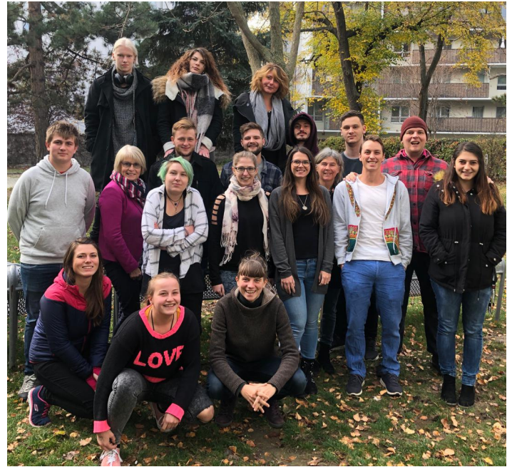
Care Leaver meeting as part of the Leaving Care Project

Additionally, the young people took part in a Media-Workshop and created poems and took photos to reflect their situation and demands, which were exhibited in the House of the European Union and shown to the politicians and participants during conference.