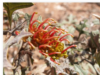
Goldfields Grevillea- Grevillea dryophylla

Underlying rocks in the St Arnaud Range are extremely ancient and were laid down some 550 million years ago as part of a deep marine sediment. Natural weathering and later incursions by ancient seas have resulted in the worn hills and poor soils.