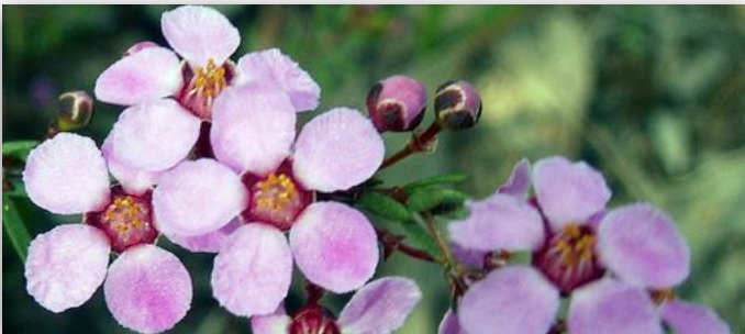
Rosy Baeckea Euryomyrtus ramosissima