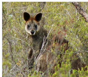
Black or Swamp Wallaby Wallabia bicolor

The Eastern Brown Snake ( Pseudonaja textilis ) and Tree Goanna ( Varanus varius ) are also about and care should be exercised when walking through the Reserve and elsewhere in the bush.