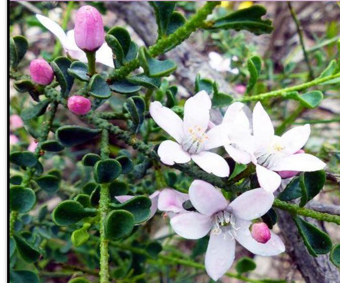
Bendigo or Fairy Waxflower Philotheca verrucosa