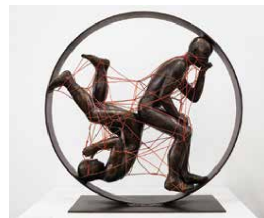
Mahi BINEBINE. The Circle , 2015. Original bronze, diameter 120 cm. Signed and numbered. © Mahi BINEBINE Courtesy of Galerie Claude Lemand, Paris