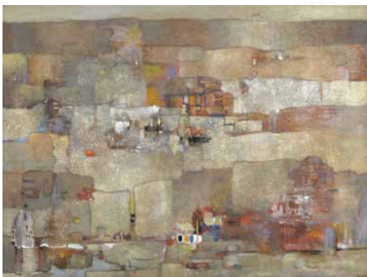
Abdelkader GUERMAZ. Imaginary Landscape , 1975. Oil on canvas, 114 x 162 cm