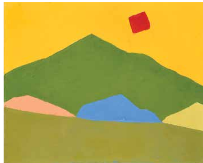
Etel ADNAN. Landscape 1 , 2014. Oil on canvas, 32 x 41 cm. © Etel ADNAN Courtesy of Galerie Claude Lemand, Paris