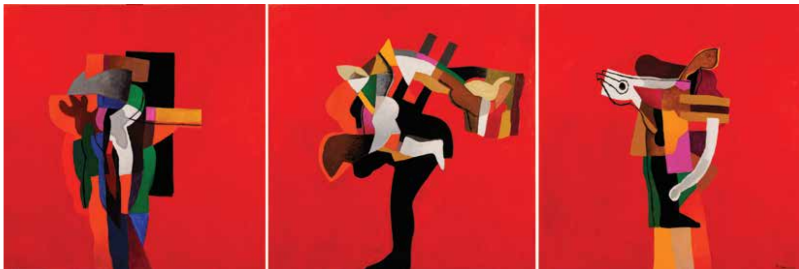
Dia Al-Azzawi. The Wounded Soul Triptych , 2014. Acrylic on canvas, 150 x 450 cm. © Dia Al-Azzawi. Courtesy of Galerie Claude Lemand, Paris