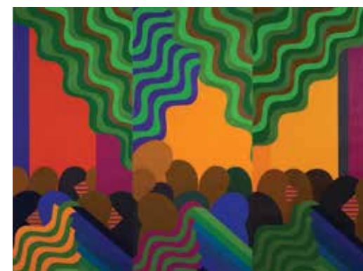
Mohamed MELEHY. Triptych , 2017. Acrylic on canvas, 180 x 240 cm. © Mohamed MELEHY Courtesy of Galerie Claude Lemand, Paris