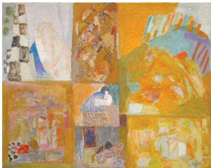
Shafic ABBOUD. Les Inspirations , 1994. Tempera sur toile, 50 x 65 cm. Donated by Christine Abboud. © Shafic ABBOUD. Courtesy of Galerie Claude Lemand, Paris