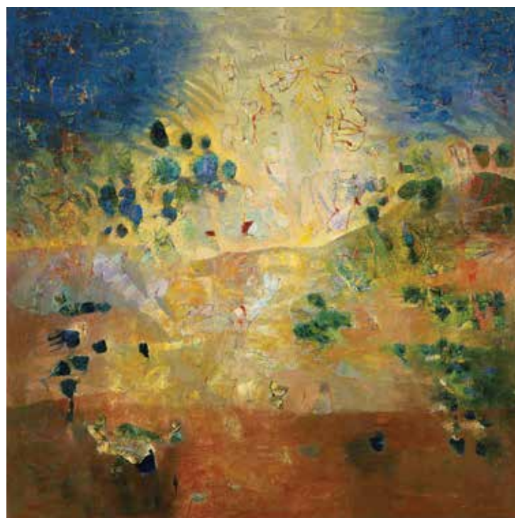
Benanteur. Le Mont des Oliviers , 1983. Oil on canvas, 120 x 120 cm © Benanteur Courtesy of Galerie Claude Lemand, Paris