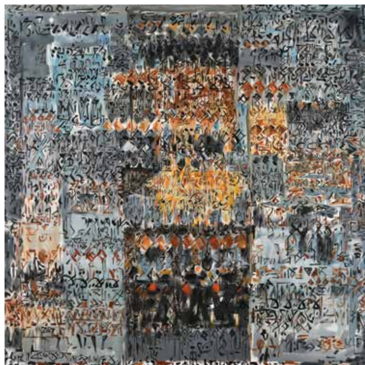
Mahjoub BEN BELLA. Chikoutimi , 2005. Oil on canvas, 200 x 200 cm © Mahjoub Ben Bella. Courtesy of Galerie Claude Lemand, Paris