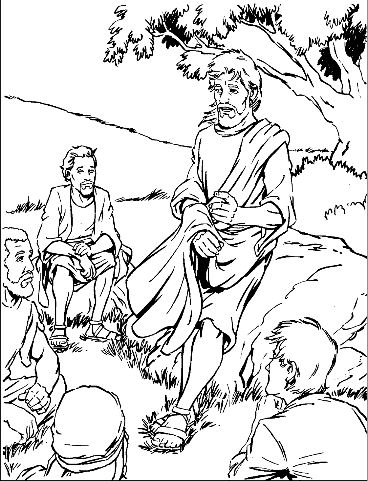
Jesus tells His disciples to cheer up.