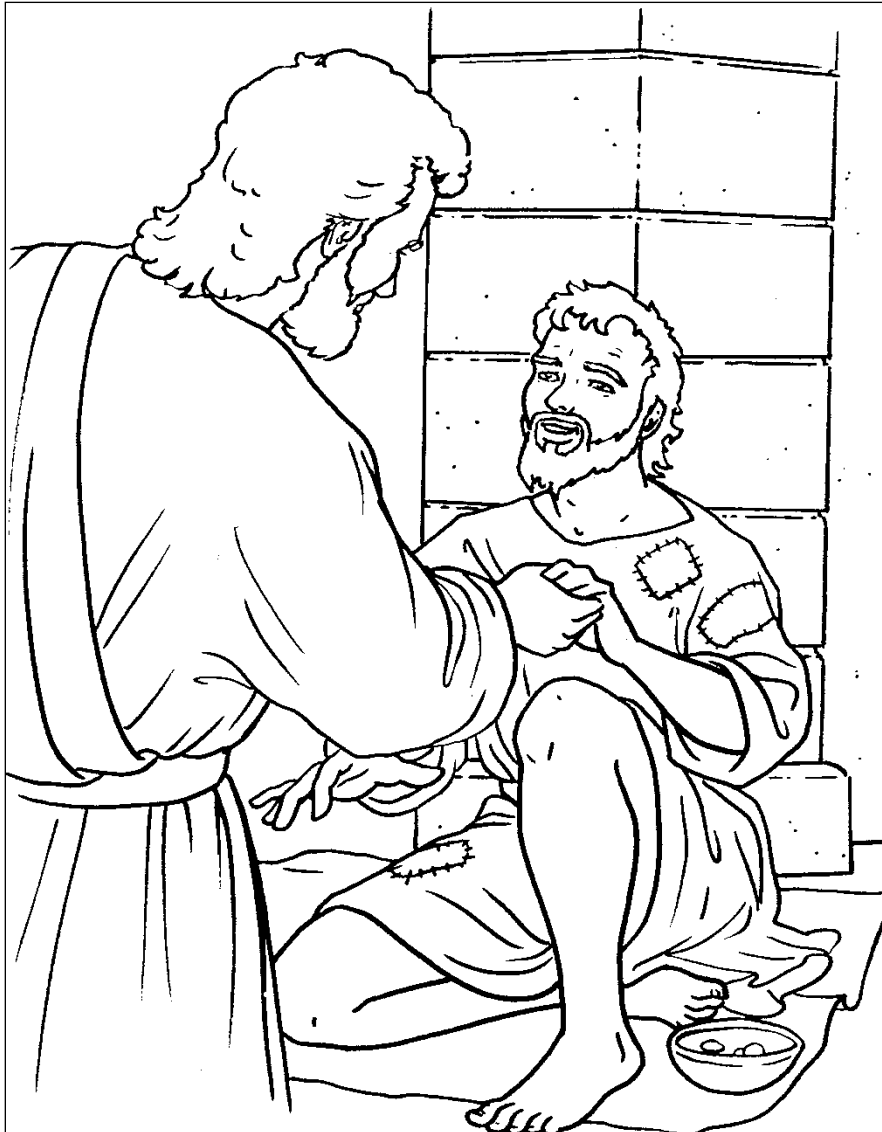
A man with a skin disease asks Jesus to heal him.

5. What happened to the men while they were on their way to the priest?