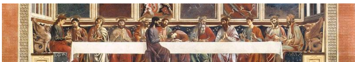
The Last Supper by Andrea del Castagno

The small church building is still present on the corner of Via Ventisette Aprile and San Gallo. The best known component is the former refectory or dining hall of the convent, the Cenacolo of Sant'Apollonia now part of the Museums of the Comune of Florence, with entrance through a nondescript door near the corner of Via Ventisette Aprile and Reparata. The refectory (1445) harbors the well-conserved fresco, The Last Supper by the Italian Renaissance artist Andrea del Castagno. Castagno created the rich marble panels that checkerboard the trompe-l'oeil walls and broke up the long white tablecloth with the dark figure of Judas the Betrayer, whose face is painted to resemble a satyr, an ancient symbol of evil.