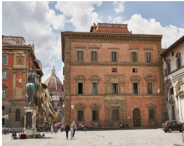
The facade of Palazzo Budini Gattai with the always-open window