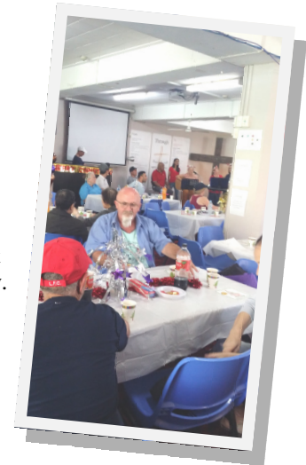
Last year Christmas at Street level in the city.