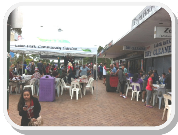
Previous Community Christmas party at Lalor Park

Lalor Park- Sunday 17th December, around 5pm in the park opposite the Freeman St Shops