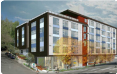
ARBORA COURT and ANCHOR FLATS

In December, Mayor Ed Murray announced that the City of Seattle Office of Housing would fund two Bellwether projects: Arbora Court in the University District and Anchor Flats in South Lake Union. Combined, the two buildings will add more than 200 new—and permanent—affordable homes. Arbora Court will serve low-income and homeless individuals and families (30–60% AMI) and Anchor Flats will serve low-income families and individuals earning 50% and 60% AMI. Construction is scheduled to begin in the fall of 2016 with completion in early 2018.