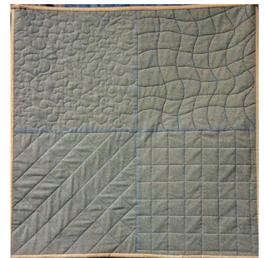
Saturday 3 rd /10 th February