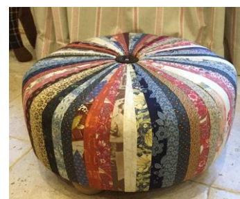
Thursday 25/ Friday 26 January