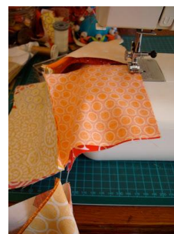
Friday 19 th January

Booking day Friday 5 th January From 9.30am in person From 11.30am on the phone