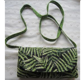
Friday 2 nd February