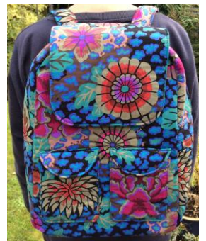
Saturday 17 th March

Back Pack with Judith Henshaw. A roomy back pack with flap pockets on the outside and a zip pocket on the inside. (Some cutting will be required before the workshop) Not suitable for beginners. Machine Sewn. All Day 10.00am - 4.00pm.