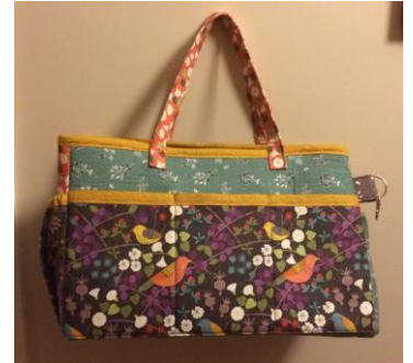
Saturday 3 rd March

Hobby Bag with Judith Henshaw. A practical craft bag to store your latest knitting or sewing projects. Plenty of pockets and internal storage for all your tools, wools, fabrics and notions. (Some cutting out will be needed before the workshop). Suitable for all levels. Machine Sewn. All Day 10.00am - 4.00pm.