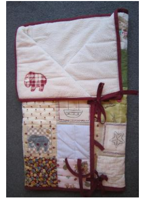
Friday 16 th March

Baby Nest /small playmat with Anne Bryant. This makes an attractive nest to carry a small baby in carefully. It opens out to give a safe area/playmat to lay baby down to kick. Great for keeping a new baby cosy and draught -free. (0 -3 months). Suitable for all levels including beginners. Machine sewn. All day 10.00am -4.00pm