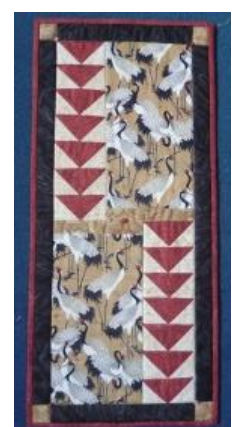
Thursday 15 th March

Fluorite Quilt with Lucy Brennan. This class is an exploration of colour gradients! Choose your own colours and design a crystal inspired quilt. Lucy will show you tips and tricks to create a unique pattern that can be made to any size. Suitable for all levels. Machine Sewn. All Day 10.00am - 4.00pm.