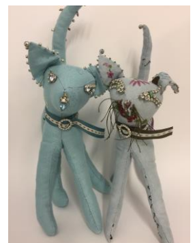
Wednesday 7 th February

Hand and Machine Sewn. All Day 10.00am - 4.00pm.