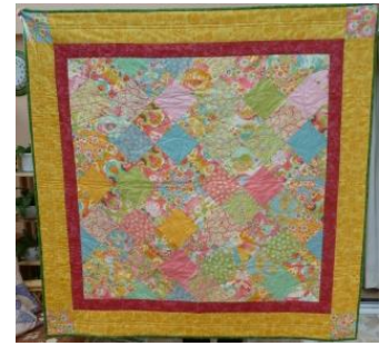
Thursday 1 st February