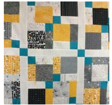
Friday 2 nd March

Split 9 patch throw with Jan Otty. This is an interesting technique and the quilt grows quickly. It is made with 2 charm packs and sashing (plus a border) but could easily be made bigger. Finished size 58" x 58. Machine sewn. Suitable for beginners upwards. All Day 10.00am - 4.00pm.