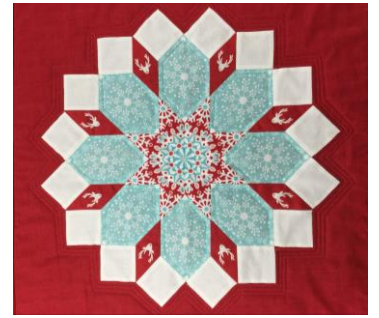
Thursday 8 th February

English Paper Piecing with Holly Palmer. Gain the knowhow to tackle a variety of EPP shapes including diamonds, hexagons, clamshells and honeycombs. Working through the day on the main block, we will cover making your own papers & templates, fussy cutting, basting shapes, piecing techniques and playing with block ideas. We will also cover hexagon and clamshell techniques with mini block ideas. All paper pieces will be provided for the day. Hand Sewn. Suitable for Beginners. All Day 10.00am – 4.00pm.