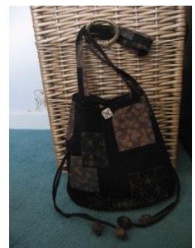
Friday 9 th March