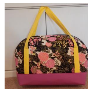
Wednesday 24 th January