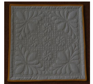
Monday 19 th March