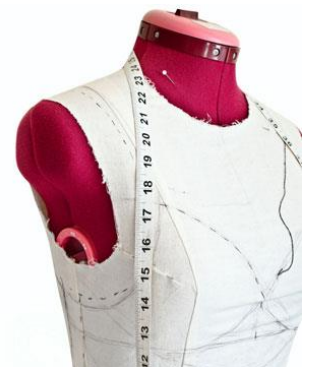
Monday 1 st April