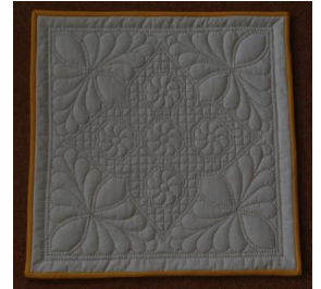
Thursday 7 th February

Come in the morning 9.30am – 12.30pm or in the afternoon 1.00pm – 4.00pm.