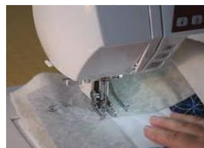
Saturday 2 nd February