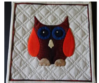
Wednesday 20 th February

Applique Owl with Anne Gosling. Learn needle turn applique using the template free method to make this cute owl wall hanging. Also makes a great centre block for a cushion. All hand stitched. Suitable for all levels. All Day 10.00am – 4.00pm.