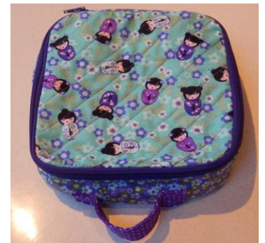
Thursday 28 th March

Lunch Box with Judith Henshaw. A zipped insulated lunch bag ideal for both children to take school everyday or adults to take to work. You could even use it for storing fat quarters. Personalise it using your favourite fabrics. All Day 10.00am - 4.00pm.