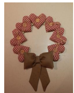
Saturday 2 nd March

Rustic Heart with Judith Henshaw. Create your own padded wreath from your own choice of fabrics. Embellish your padded hearts with buttons and raffia. Finish with a large padded bow. All attached onto a 10" wire ring. All Day 10.00am – 4.00pm.