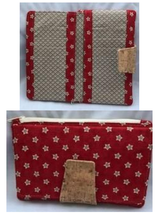
Friday 15 th February

Pearl Purse with Helen Dudgeon This easy-to-sew wallet features 8 card slots, 2 note slots, a large zippered compartment, and a detachable bifold compartment. A removable wristlet strap comes in handy when you just need to carry the essentials. Just slip your phone into the zippered compartment and go! Machine Sewn. All Day 10.00am – 4.00pm.