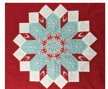
Wednesday 20 th March