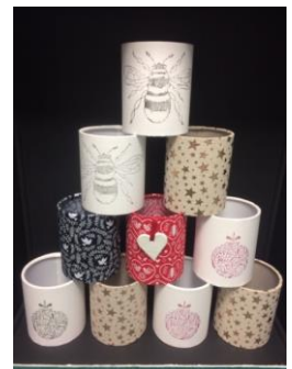
Friday 8 th February Morning

(The kits needed for this workshop will be available to purchase at Patchfinders nearer to the date)