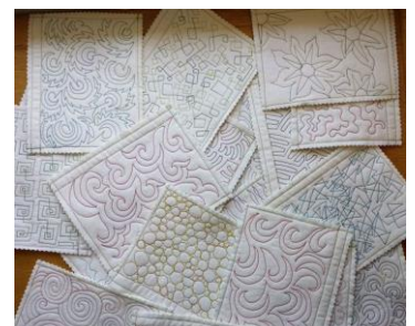
Saturday 9 th February

Machine Quilting Part 2 with Lucy Brennan and Alison Forbes. Plan your quilting and put it into practice. In this second class we will expand on basic quilting patterns and will cover the use of stencils, marking, joining "quilt as you go" and practise free motion quilting. You can bring a quilt top to the class (optional) and leave feeling confident about the quilting. The two day course will give you confidence in your quilting. Machine Sewn. All Day 10.00am – 4.00pm.