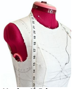
Monday 4 th February

Come in the morning 9.45am – 12.45pm or in the afternoon 1.15pm – 4.15pm.