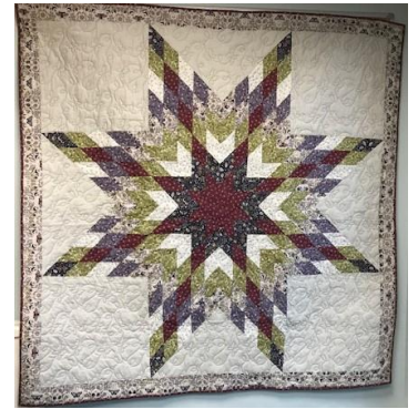
Saturday 13 th April

Come in the morning 9.30am - 12.30pm or in the afternoon 1.00pm - 4.00pm.