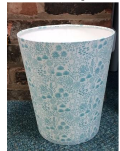
Friday 8 th February Afternoon