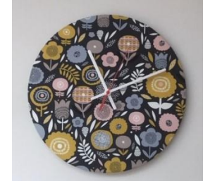
Wednesday 6 th March Afternoon