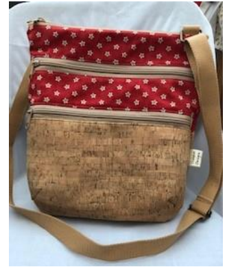
Friday 22 nd March

Triple Zip Crossbody Bag with Helen Dudgeon. This is a nice basic pattern for beginners or even advanced bag makers. Embellish and alter The Triple Zip to your heart's desire. The three panels allow for mixing colours or adding applique, embroidery, or anything you'd like to create. 2 internal slip pockets, 2 external zip pockets and adjustable strap. All Day 10.00am - 4.00pm.