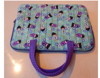
Friday 8 th March