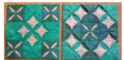
Saturday 16 th March