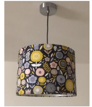
Wednesday 6 th March Morning