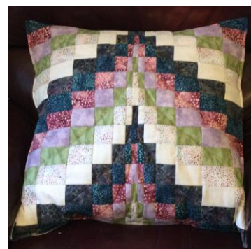
Friday 1 st February

Booking day Friday 4 th January From 9.30am in person From 11.30am on the phone