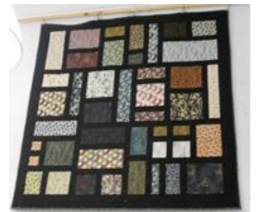
Friday 15 th March