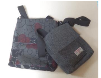
Saturday 16 th February

Messenger Bag with Judith Henshaw. A cross body bag with an adjustable strap and magnetic fastener. A front pocket, which if cut on the bias gives it a special finish. Choose from a small or medium sized bag. Machine Sewn. All day 10.00am – 4.00pm.