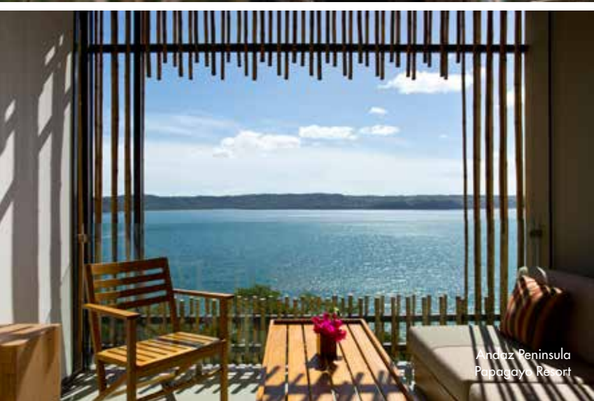
Andaz Peninsula Papagayo Resort

From Costa Rica’s relaxed culture to its thriving eco system, it stands as one of the top places to lose yourself in nature, while still attaining an eco-lux experience. So when you consider your next escape from the real world, think pura vida! ●