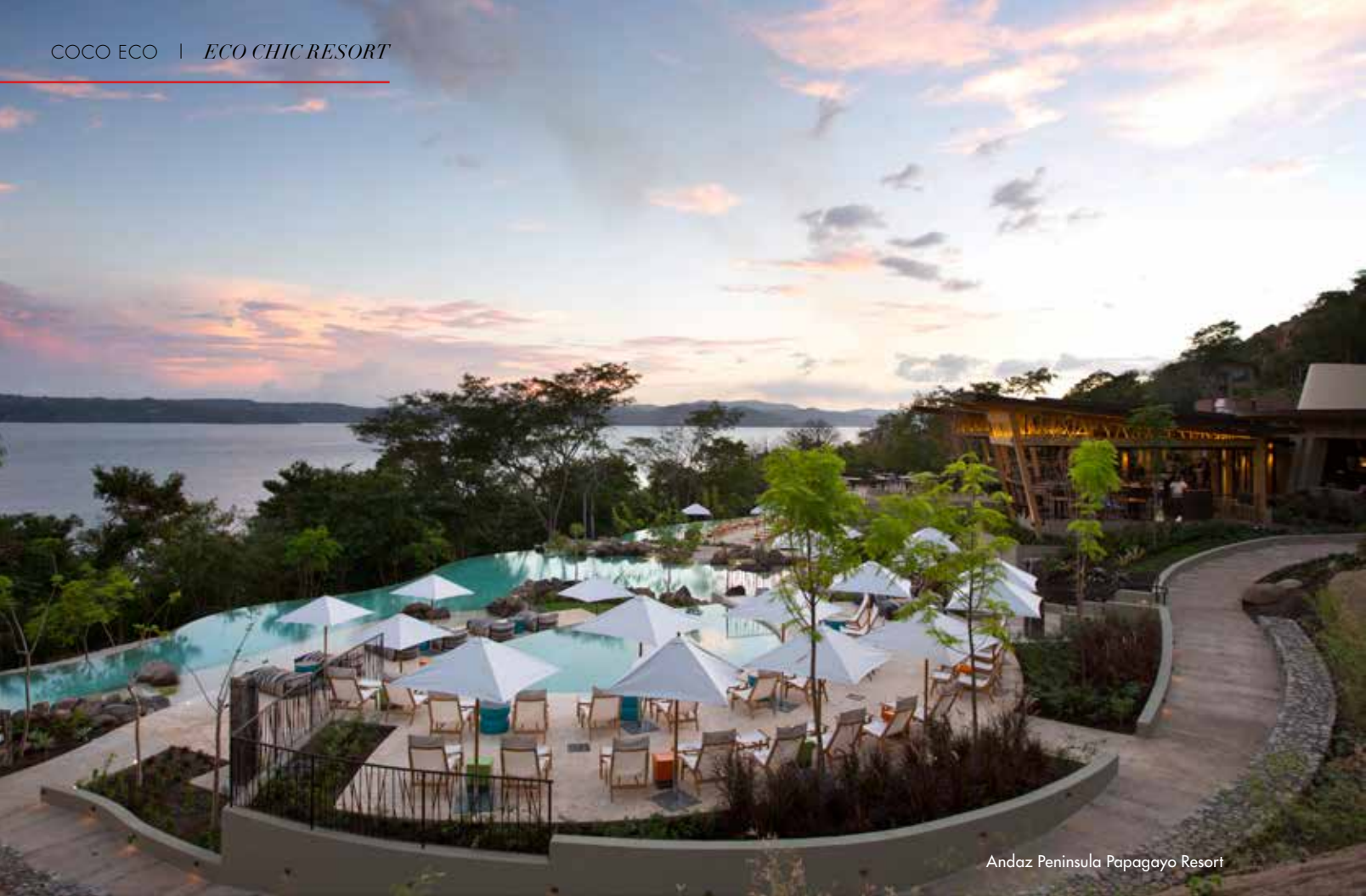
Andaz Peninsula Papagayo Resort