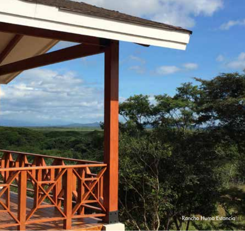
Rancho Humo Estancia