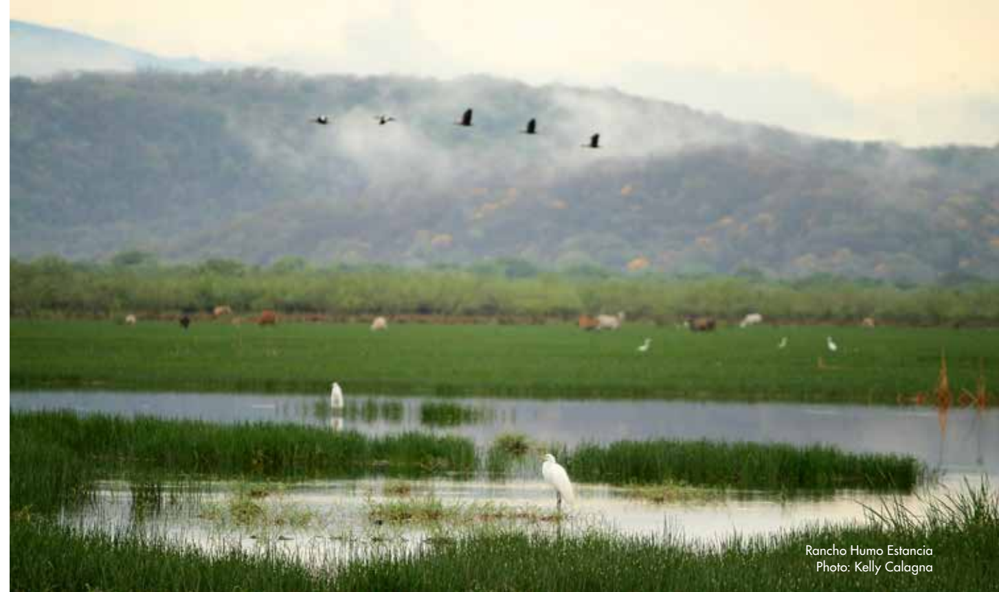
Rancho Humo Estancia

The Costa Ricans live by the motto “pura vida,” which directly translates to “pure life.” The culture embraces “pura vida” as a mantra toward pursuing happiness and living a peaceful existence toward each other, and the environment. This military-free country is known as one of the most sustainable nations in the world, and has ranked second for the last three consecutive years in Environmental Sustainability by the World Energy Council. Costa Rica is truly the ultimate eco retreat destination.