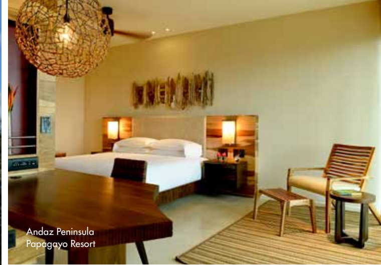
Andaz Peninsula Papagayo Resort