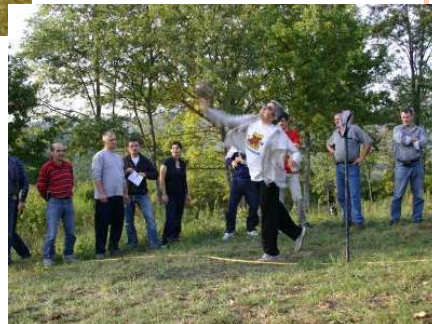
Stone throwing from shoulder