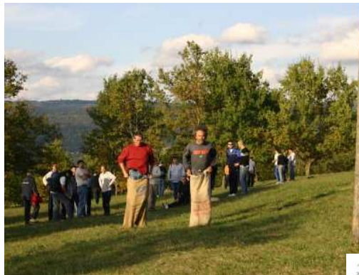
potato sack racing