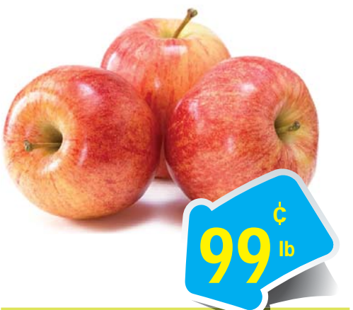
Fuji Apple - Táo Fuji