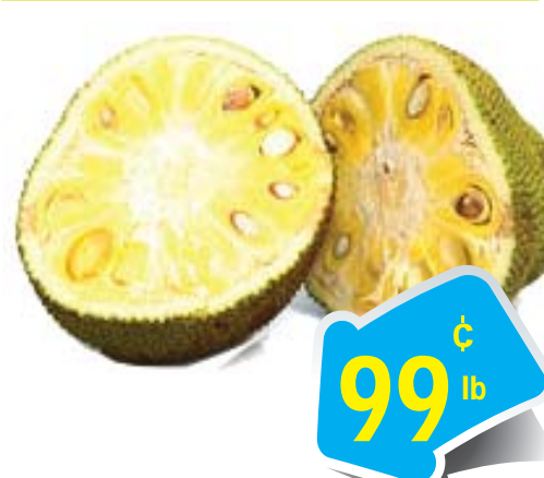
Whole Jackfruit - Mít Nguyên Trái