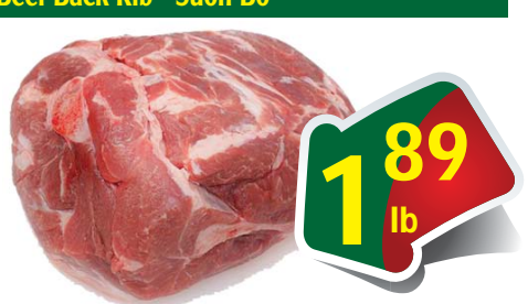
Regular Pork Butt - Thịt Heo Đùi Sau