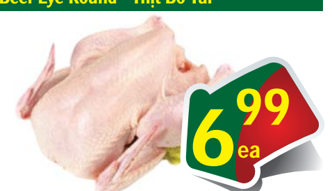
Free Range Chicken - Gà Đi Bộ