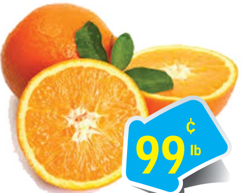
Orange California - Cam Cali