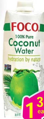
Foco Coconut Water F-C - Nước Dừa Tươi 16.9 Fl oz