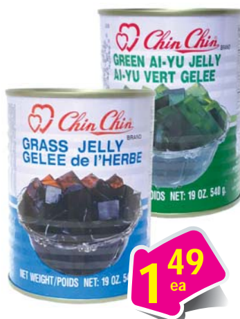
Chin Chin Green Jelly Black Grass Jelly Sương Sáo, Sương Sa 19 oz