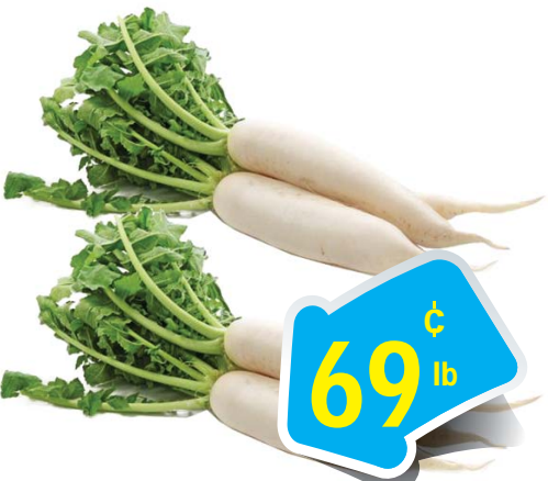
White Daikon - Củ Cải Trắng