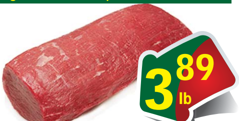
Beef Eye Round - Thịt Bò Tái