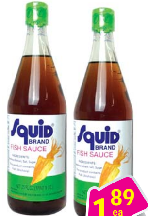
Squid Fish Sauce Nước Mắm Mực 25 Fl oz