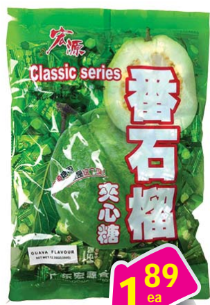
Hong Yuan Candy Guava Keo Ôi 350 gr