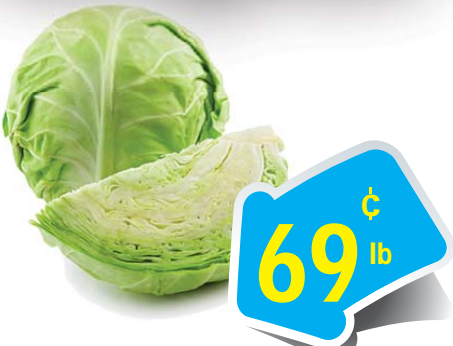
Green Cabbage - Bắp Cải