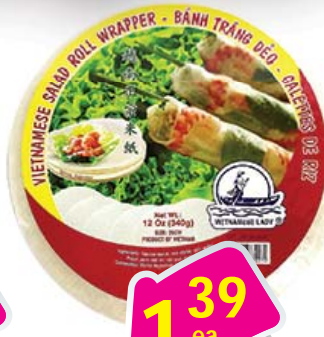
VN Lady Rice Paper 25cm Bánh Tráng Dẻo 12 oz / 25 cm