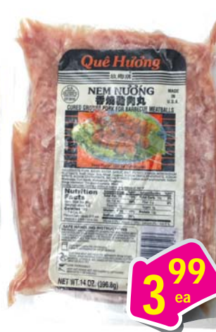
Que Huong Fz Cured Ground Pork Nem Nướng 14 oz