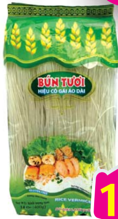
Data Food Rice Vermicelli - Bún Tươi 14 oz