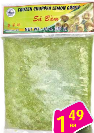
VN Lady Fz Lemongrass Sả Bằm 16 oz