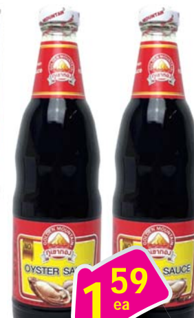
Golden MT Oyster Sauce Dầu Hào 23.3 oz