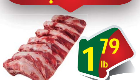
Beef Back Rib - Sườn Bò