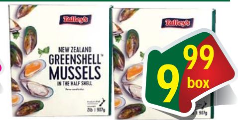
Green Mussels Half Shell - Chem Chép Nửa Vỏ