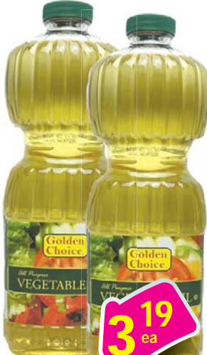
Golden Choice Vegetable Oil - Dầu Rau Cải 48 Fl oz