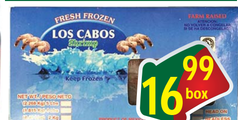
White Shrimp 30-40 - 4 lbs