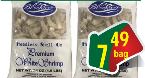
White Shrimp IQF 41-50 - 24oz