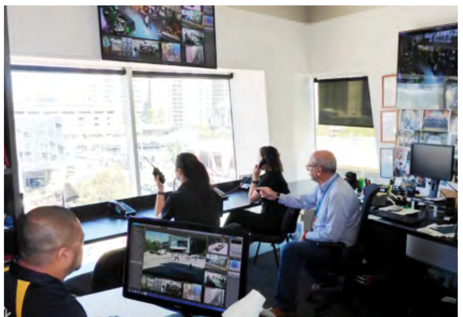
Federation Square EOC.