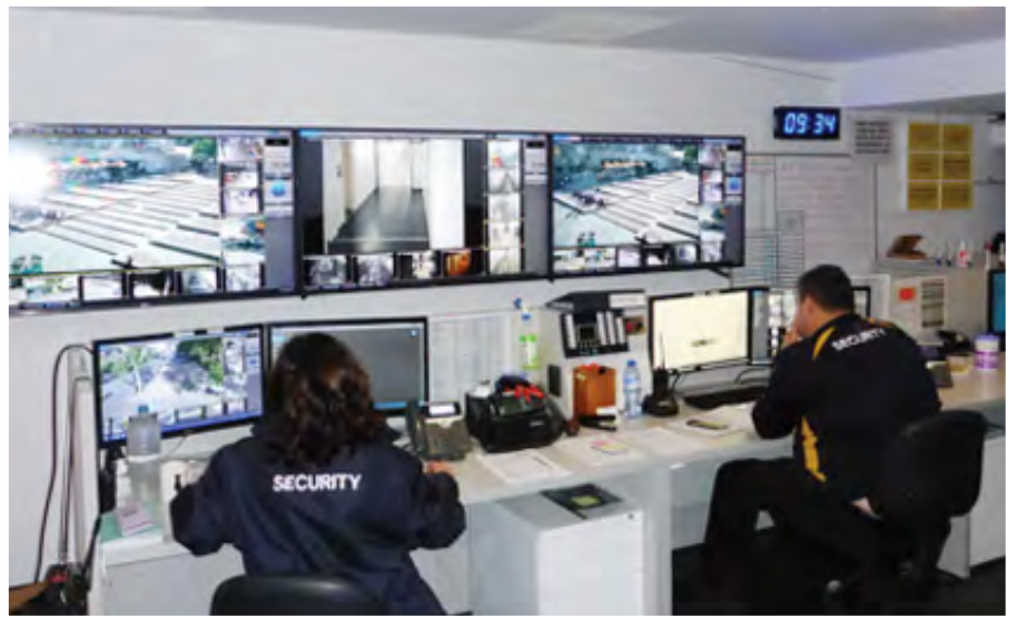
Federation Square Control Room after rebuild.