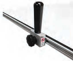
Table-side patient handgrips