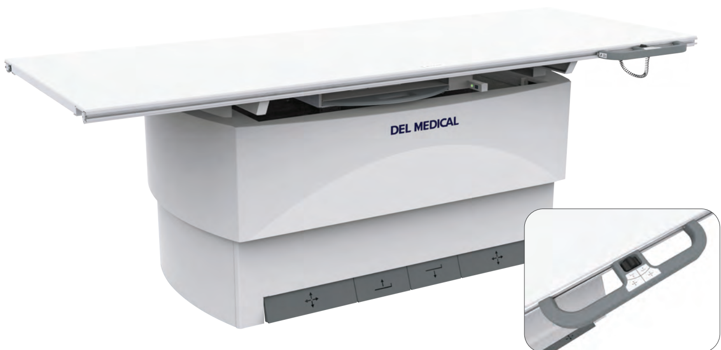
Table-Side User Controls