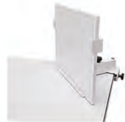
Lateral cassette holder