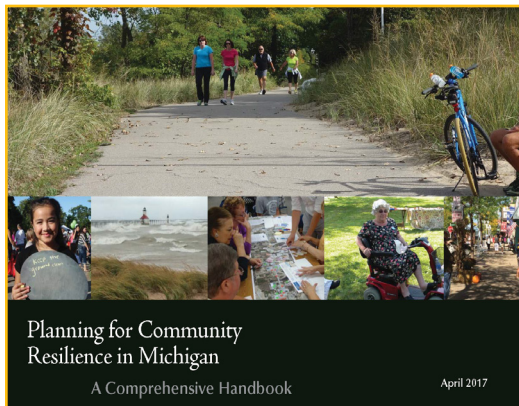
Planning for Community Resilience in Michigan: A Comprehensive Handbook

The Michigan Association of Planning, the state chapter of the American Planning Association, is a nonprofit organization dedicated to promoting sound community land use planning that benefits the residents of Michigan. Learn more at www.planningmi.org .