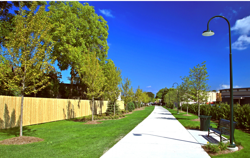
A view of the Petoskey Downtown Greenway, South Segment, Petoskey, Michigan.

When you already love the work you do, receiving special recognition for a project is especially meaningful. We are delighted to announce that the Petoskey Downtown Greenway South Segment has been selected by the Michigan Recreation & Park Association (mParks) to receive a 2018 Park Design Award .