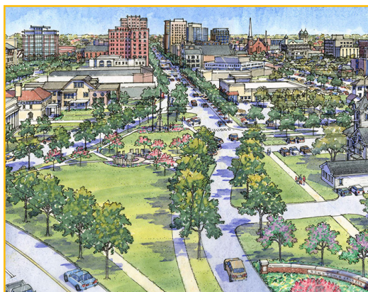
Jackson Downtown Streetscape, Vision Illustration