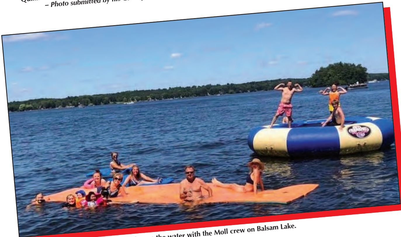
Fun on the water with the Moll crew on Balsam Lake.