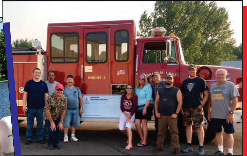
BLHA representatives presenting a check to representatives of the Balsam Lake Fire Department for donations BLHA received from attendees of our "Welcome to Summer Party."