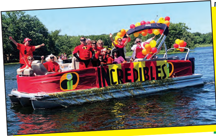
2nd Place: The Incredibles - The Keogh Family