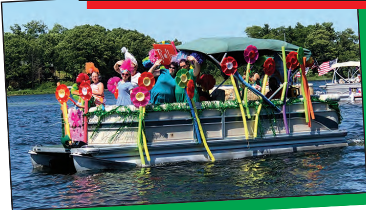
4th Place: Trolls and Flowers - The Erickson Family