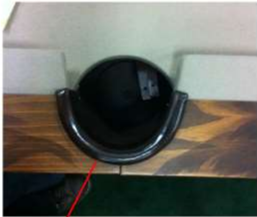
Side Pocket (2)

Step 15: Once all rails/blinds are straight and flush, tighten all rail nuts with deep well socket.