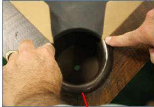
Corner Pocket (4)

Step 13: NOTE: the side pockets and corner pockets ARE different and will only work correctly one way. To install the pockets, squeeze the top of the pocket and bring it up through the pocket opening from the bottom. Be sure not to push back the pockets so they are flush against the rail; the first priority is to ensure they line up with the felt near the playing surface. Peel back the paper to reveal the sticky side of the velcro on the backside of the Pocket to secure the Pocket to the Rail.