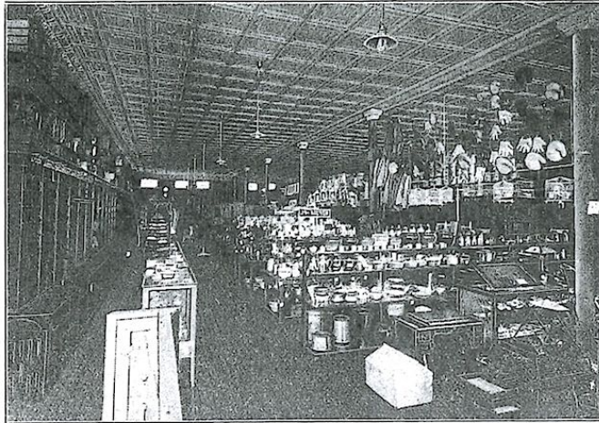
A GLIMPSE INTO THE BIG SCHRANDT & MILLER STORE