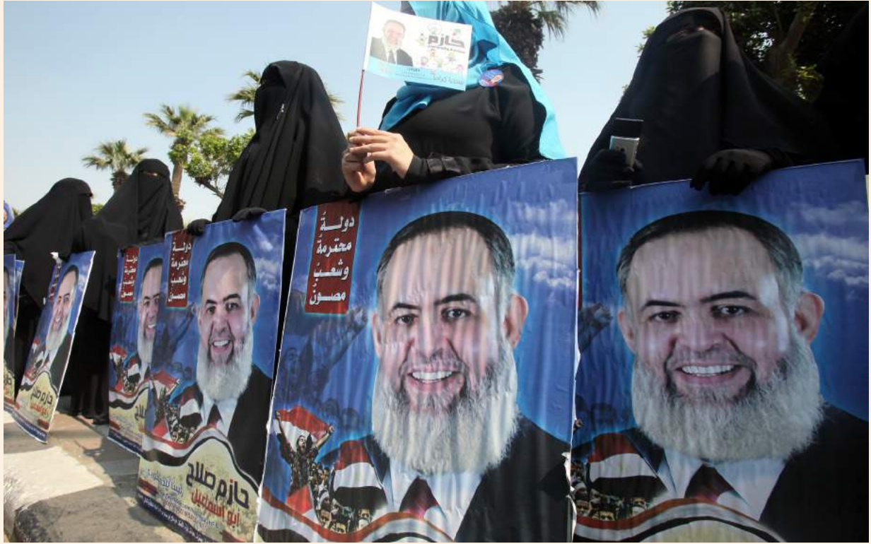
Campaign rally for Salafist presidential candidate Hazem Abu Ismail in Egypt in 2012.

encroachments of foreign power and the weakening of the umma from within.” 35 The Brotherhood would become the model for other Islamist organizations that would emerge, particularly in Egypt in the 1970s and Islam again became an alternative to the government, which was failing its citizens. It was in this atmosphere in Egypt that Salafism as a branch of Islamism became uniquely popular, with various groups emerging at universities, mostly in Alexandria. These groups attracted large numbers of students who felt disenfranchised from society and further felt that other Islamist alternatives, like the Muslim Brotherhood, were untrustworthy. It's important to note here that the Muslim Brotherhood can also be classified as a Salafi organization, in line with the writings and ideas of Afghani. It did however differ significantly in ideology from the Salafi organizations that arose in the 1970s, such as al-dawa al-Salafiyya , in line with Ibn Taymiyya's teachings.