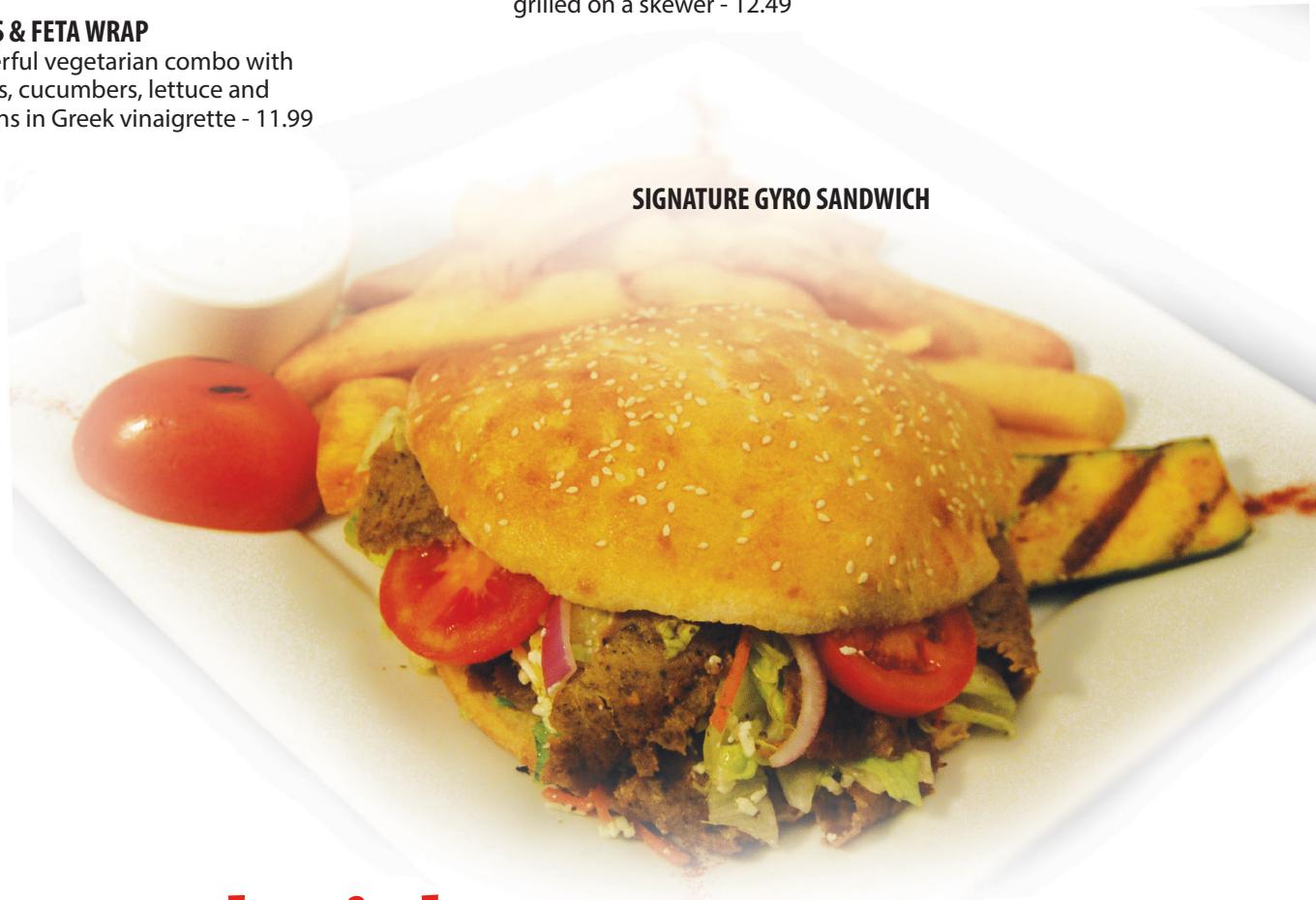
SIGNATURE GYRO SANDWICH

Lightly seasoned chicken breast cubes, mushrooms and onions grilled on a skewer - 12.49