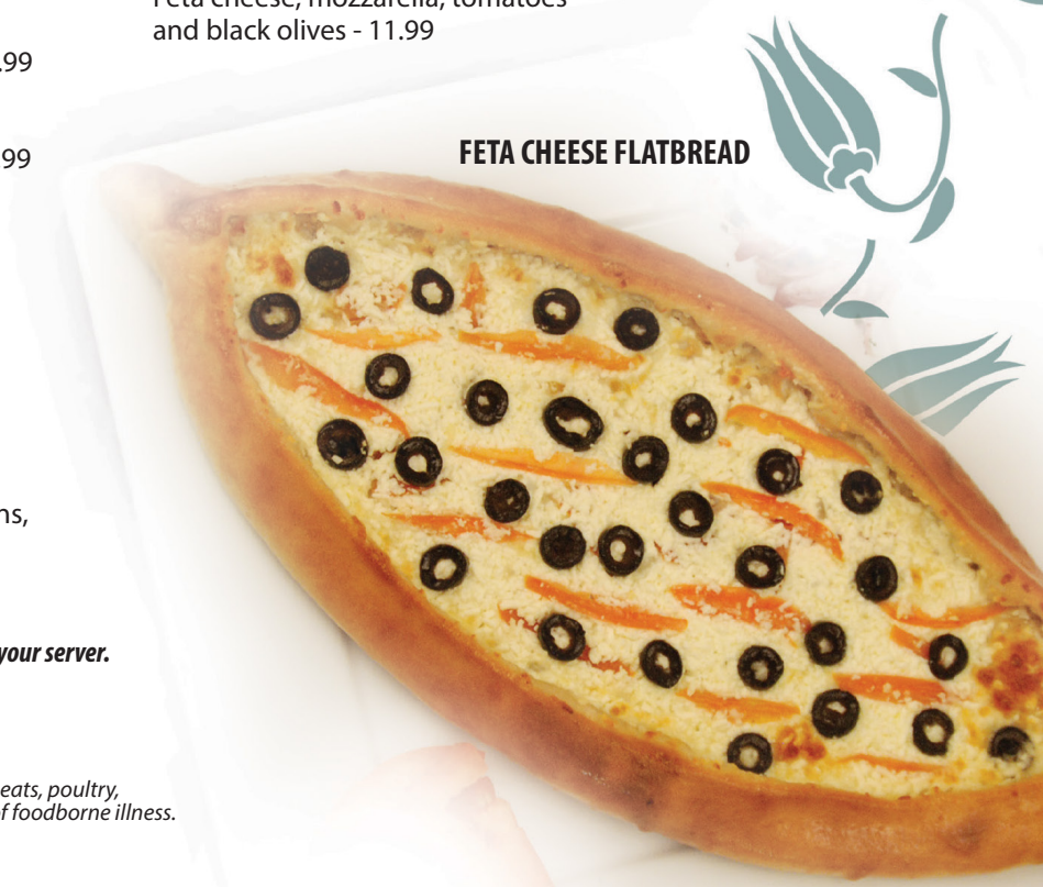
FETA CHEESE FLATBREAD

Catering Menu, Take-Out Menu and Gift Cards available, just ask your server. There will be a 3.00 plate charge for sharing.