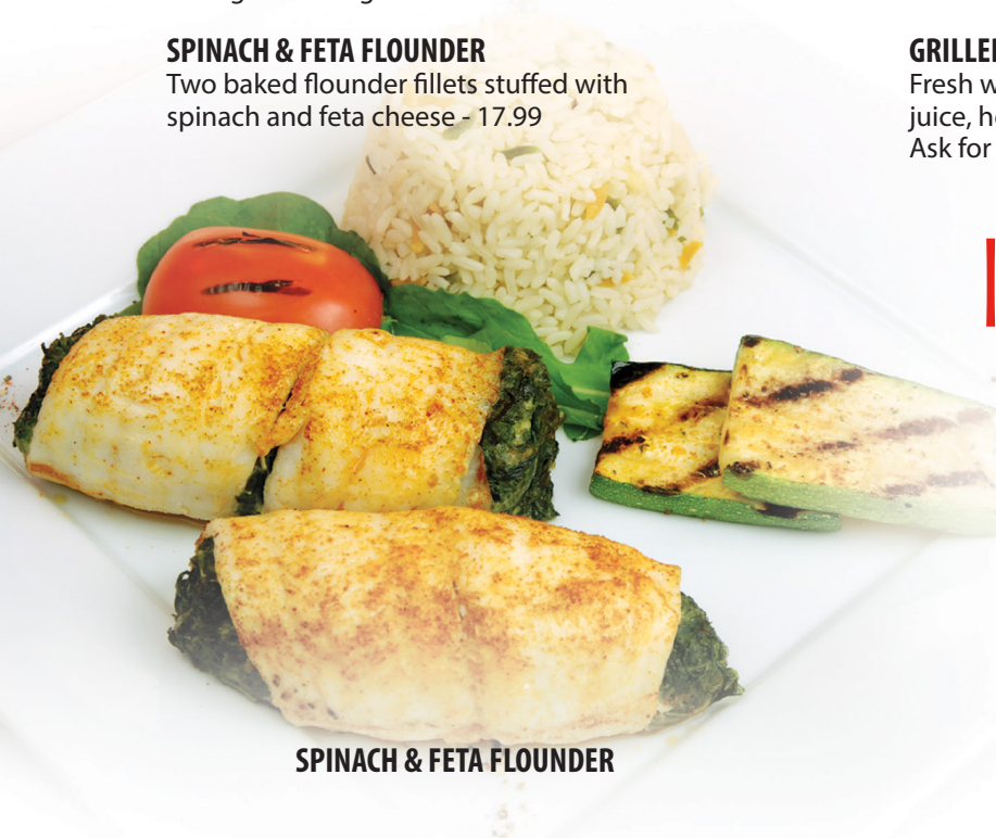
SPINACH & FETA FLOUNDER

Fresh whole fish lightly basted with olive oil, lemon juice, herbs and seasonings and gently grilled. Ask for today's selection - Market Price