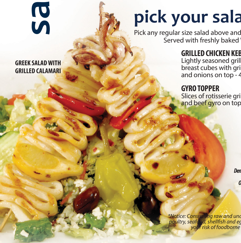
GREEK SALAD WITH GRILLED CALAMARI

Pick any regular size salad above and pick any topping below to create your own combination. Served with freshly baked Wild Fig flatbread and yogurt sauce on the side.