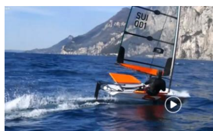
Riding too high, the main foil ventilates and begins to dive