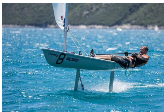
RS Aero and International Laser dinghies enhanced with Glide Free Foils