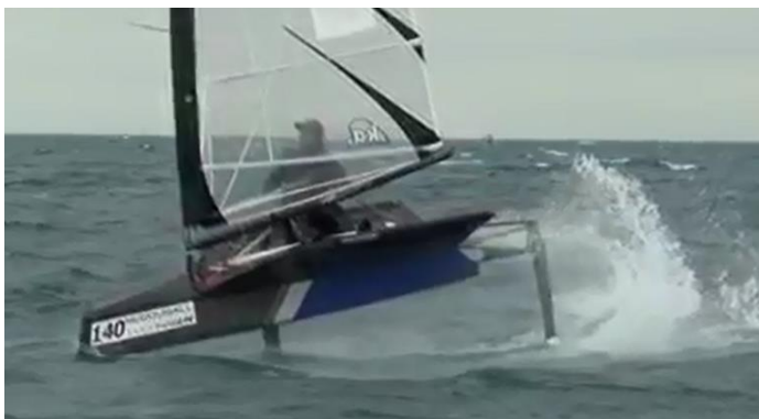
Heading down for a 'nose dive'

In the event of a severe breach, such as when the boat leaps out of a wave leading to a crash or nosedive, foiling systems with a fixed sections such as those used on catamarans and Moths can go into negative angle of attack. The foil is no longer lifting, but sucks the boat down, acting as a brake, tripping the boat up, causing a dangerous pitchpole.