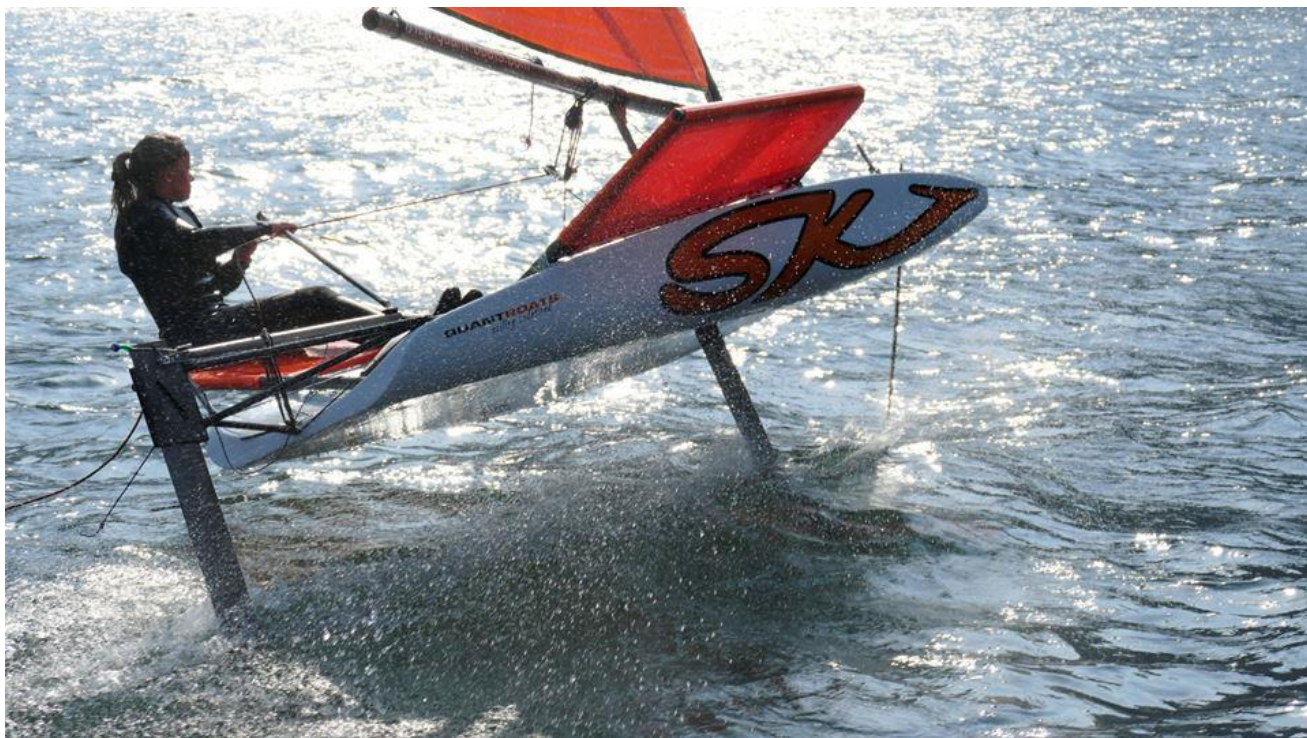
Skeeta Foiling dinghy utilises the Glide Free foiling system.

We are especially proud that our patented foiling system has been chosen by Skeeta Foiling Craft as a key component of their unique Skeeta foiling dinghy. This boat is a culmination of many unique developments which further enhance the foiling experience.