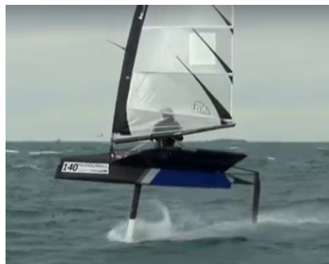
Breaching the surface and ventilating