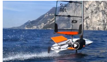
The main foil recovers easily, without a crash or pitchpole