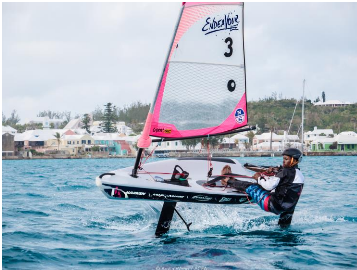
Melges 14 and Open Bic dinghies enhanced with Glide Free foils

We are especially proud that our patented foiling system has been chosen by Skeeta Foiling Craft as a key component of their unique Skeeta foiling dinghy. This boat is a culmination of many unique developments which further enhance the foiling experience.