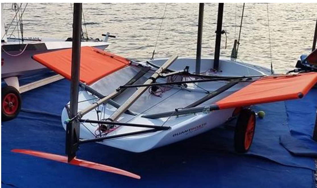
Simple rudder foil requires no twist grip adjustment and can be inserted from above.

As the foil always naturally finds its optimum angle of attack, there is no need to trim the rudder to compensate as is necessary for foils with flaps. As a result, there is no need for an adjustable rudder foil. This reduces complication, cost and the constant need to actively trim the boat as its speed changes.