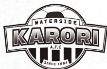
Photo Gallery Integration Works Waterside Karori vs Wellington United