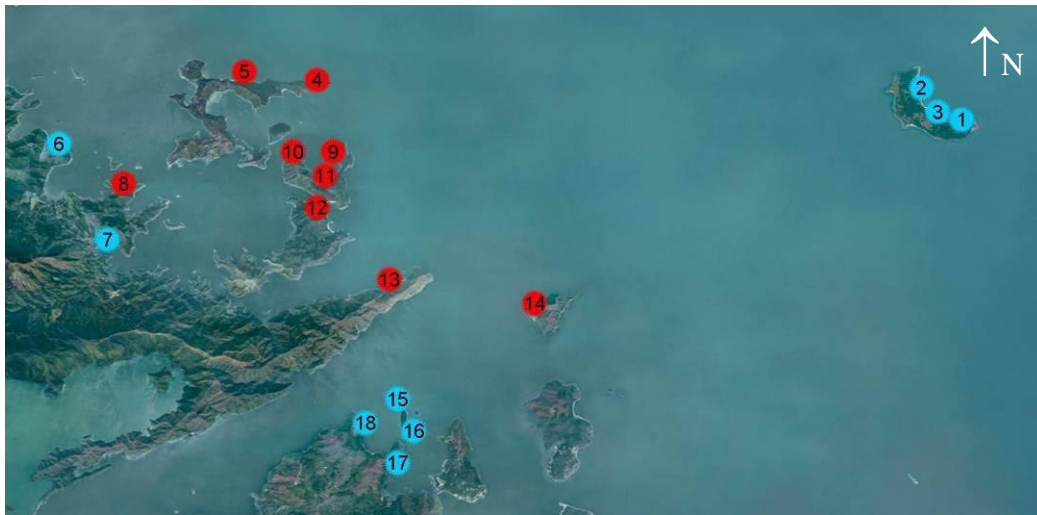
Figure 1 Reef Check site location & hard coral coverage comparison (2016 vs 2017)