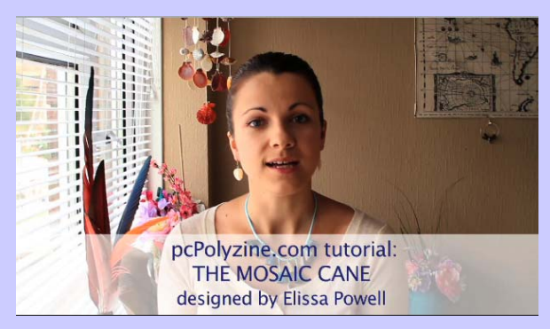
Watch our YouTube Video Now

Mosaics - an endless source of intrigue! Through infinite patience and painstaking work, an artist can create a timeless piece of beauty. Mosaics can be created with polymer clay - with just as awesome a result as with the original tile and grout! With my usual eye toward simplicity, I present my version of the mosaic cane. Also, check out this video that now has over 13,000 <u>YouTube views!</u>