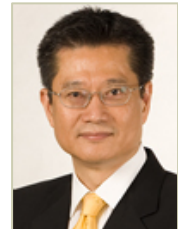
Mr. Paul Chan

Mr. Paul M. P. Chan is a member of the Legislative Council of HKSAR, representing the Accountancy Constituency. He is a former President of the Hong Kong Institute of Certified Public Accountants (HKICPA) and former Chairman of ACCA-HK. He currently serves as a member on both the SMP Committee of the International Federation of Accountants ("IFAC") and the Working Group on Accounting Standards for SMEs of the International Accounting Standards Board ("IASB").