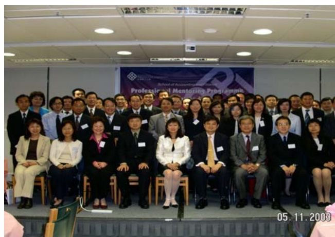
Group photo taken at the orientation dinner