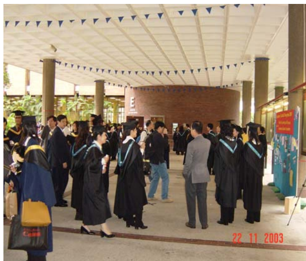
Photos taken at the graduates tea reception